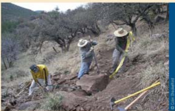
Many hands helped make this trail project possible. More than 1,800 volunteer hours went into the construction of this trail. If you would like to be a Nature Conservancy volunteer, please call our Fort Davis office at (432) 426-2390.

Wildlife: The best times to see wildlife activity are in the morning or early evening. If you are fortunate enough to see any wild animals, enjoy their beauty but please do not approach or disturb them. Several venomous or dangerous snakes occur on the preserve. Please watch your step during warm periods when snakes may be active.