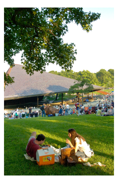
Picnickers at the Blosom Music Center in Cuvahoga Valley National Park

LWCF state assistance grants have further supported hundreds of projects across Ohio's state and local parks including Chestnut Hills Trailhead in Portage County, City of Toronto War Memorial in Jefferson County and Middle Bass Island in Ottawa County.