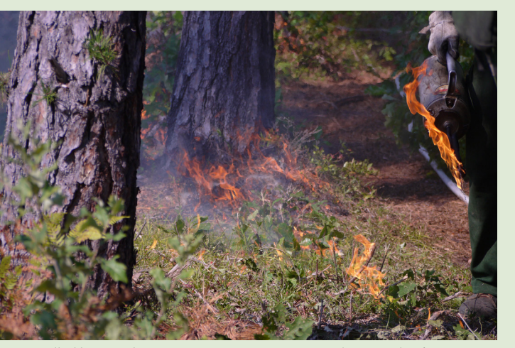
A controlled burn in the Ossipee Pine Barrens.

examples of the rare pitch pine-scrub oak woodland; a quartermile of undeveloped shoreline on Ossipee Lake; much of Cook's Pond and a stream connecting it with Silver Lake, a popular destination for local paddlers. There are many opportunities for hiking, kayaking, cross-country skiing, hunting and snowmobiling.