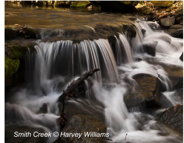
Smith Creek