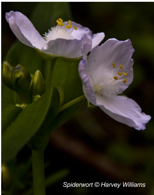
Spiderwort

“We’ve known of The Nature Conservancy for years, and we just know they are a great organization. It gave us comfort knowing an organization of this scale and strength would be managing it.”