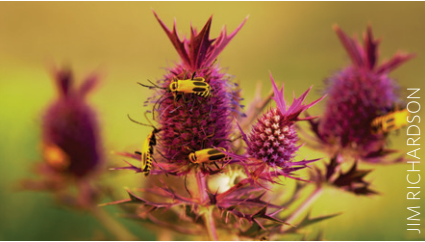
BEE DETECTIVE Discover the Culprit Behind Declining Bee Populations