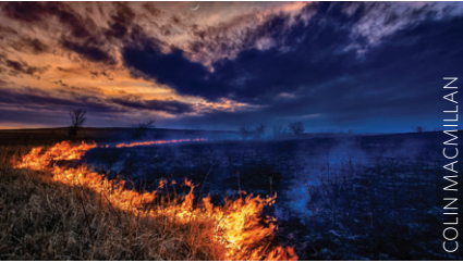
FIGHTING FIRE WITH FIRE Can fire positively impact and ecosystem?