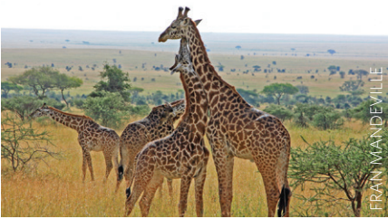
THE DESERTS AND GRASSLANDS OF AFRICA A Virtual Field Trip