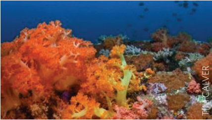
THE NEED IS MUTUAL The Importance of Biological Interactions