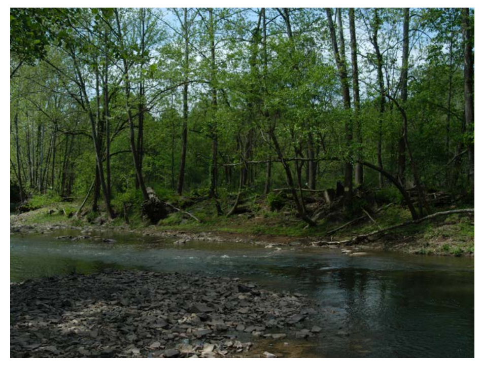
Riparian habitats provide many ecological functions, including stabilizing soil along stream banks and regulating stream temperature.

Preservation of riparian vegetation to control erosion is also important in protecting fish populations because fine sediments can fill in spawning gravels and adversely affect egg development and/or larval fish emergence.<sup>43,62</sup> Failure to maintain riparian buffers might also result in reduced organic matter inputs, including coarse woody debris in streams and wetlands.<sup>6,69</sup> These inputs are critical in regulating energy dynamics and providing habitat structure.