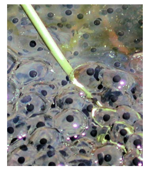
Sedimentation can fill spawning gravels and adversely affect egg development and/or larval emergence.

involve establishing buffers along and around aquatic habitats (e.g., streams, lakes, ponds, wetlands, vernal pools, spring seeps), interior forest, and other sensitive wildlife habitats to minimize impacts to fish and wildlife. Prior to development, identify wildlife and habitat areas that might benefit from buffers by completing a <u>survey</u> of biological and physical components. Take into account the sensitivity of species, their habitat and landscape characteristics to determine the most appropriate width and configuration of buffers.