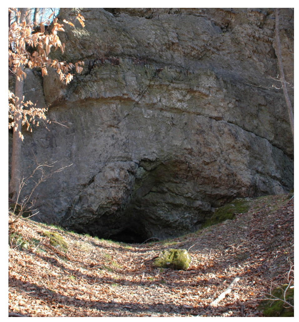
Buffers can minimize impacts to cave species and habitats. Reducing impacts to bat populations by minimizing disturbances has become increasingly important as Myotis populations in the Appalachian region have recently been decimated by white-nose syndrome.