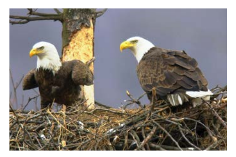
Human activity can potentially disturb bald eagles, interfering with feeding, nesting and breeding activities.

include adopting a landscape perspective to assure continuous riparian buffers and connectivity to forest interior and upland buffers. Annually monitor and treat buffers for occurrences of invasive plant species.