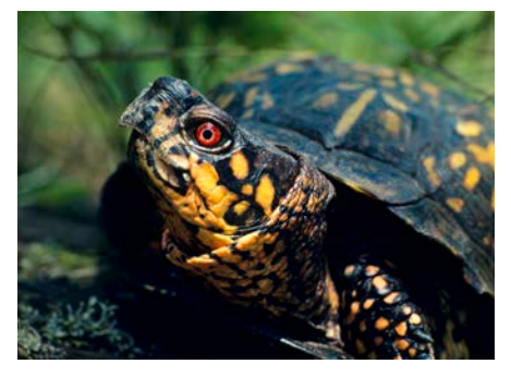
Reptiles, like the eastern box turtle, need a variety of habitats for foraging, breeding and nesting activities. Maintaining riparian buffers and connectivity between habitat areas is important.

negatively impacted by inadequate buffers. They are particularly sensitive to changes in water quality.<sup>46</sup> The Appalachian region hosts dozens of freshwater mussel species, several of which are federally endangered.