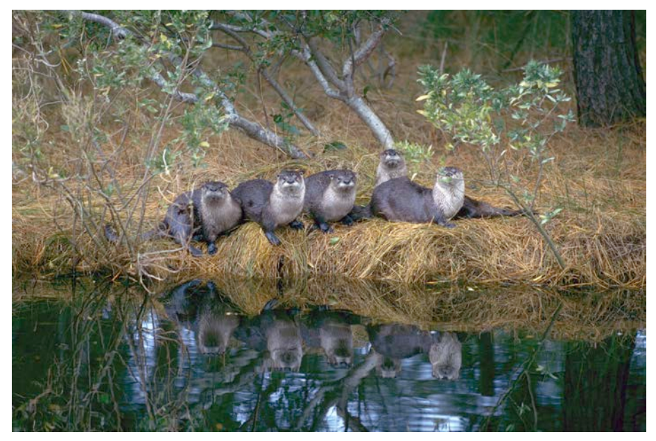
Streams create important fish and wildlife habitat and provide essential aquatic ecosystem processes.

A major function of riparian buffers is to control erosion and sedimentation by stabilizing banks and filtering sediments and nutrients.<sup>6,60,63</sup> Sedimentation can negatively affect water quality and aquatic species, as well as alter stream and wetland characteristics.<sup>64</sup> In addition. sedimentation reduces the amount of light in the water column which can decrease primary production (i.e. submerged vegetation or zooplankton). This can cause cascading effects throughout the ecosystem and significantly reduce populations of aquatic organisms through mortality, reduced physiological condition and habitat avoidance.<sup>3,65</sup> Riparian buffers capture and slowly filter the overland runoff of stormwater and nutrients, which can otherwise stress aquatic ecosystems.66-68