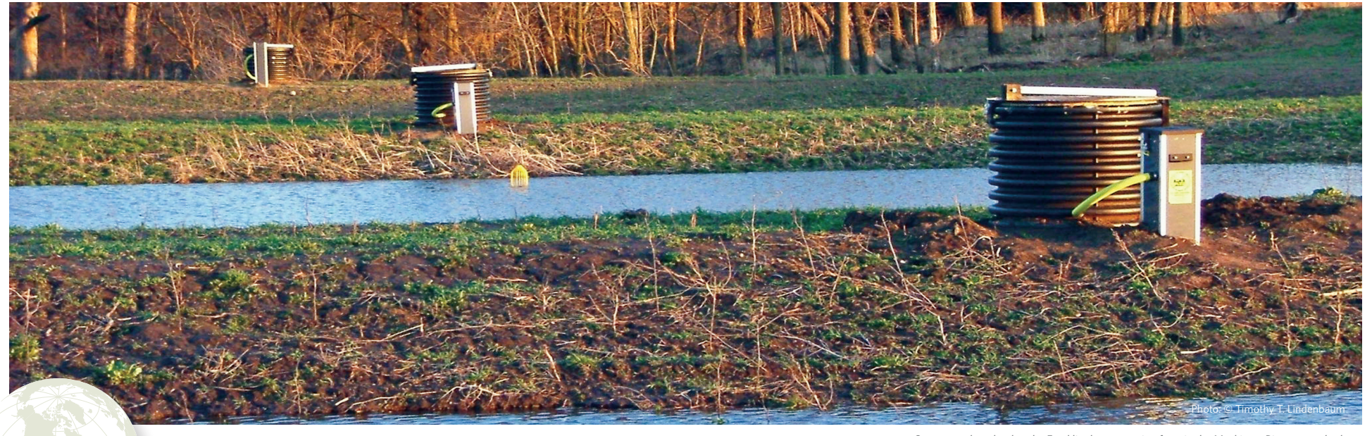
Constructed wetland at the Franklin demonstration farm in the Mackinaw River watershed.