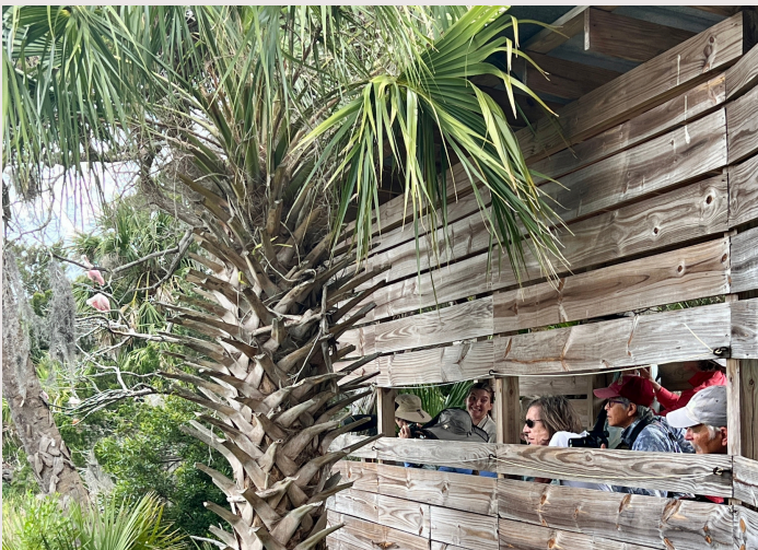
Photos: Sunset on Little St. Simons Island, GA © Marc Del Santoro; Bird Blind, Little St. Simons Island, GA © Erin Crowther/TNC

Its wetlands, woods and shell-strewn coastline beckon exploration by foot and kayak. A prime spot for bird-watching, it offers close-up views of migratory birds feeding in the morning shadows and surf. Whether you paddle through tidal creeks and salt marshes or stroll through maritime forests with moss-draped oaks, you'll be certain to enjoy this incredible retreat.