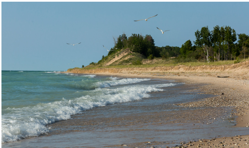
The Zetterberg Preserve can be viewed from the beach or from the south side of Point Betsie Road, where the preserve sign is located. Please do not walk on the dunes, as they are a fragile ecosystem susceptible to erosion.

Help us keep track of the species at our preserves by using iNaturalist to record your observations. Learn more at nature.org/miexplore .