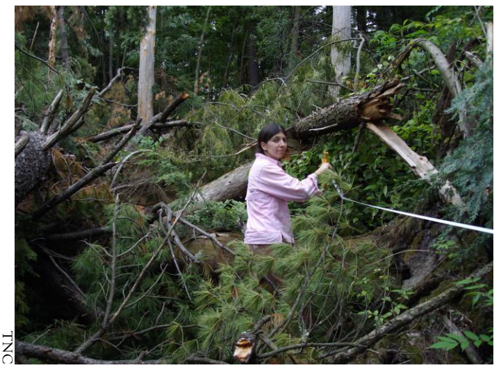
Measuring storm damage in Williams Woods

Many inhabitants of the forest depend on periodic disturbance to create structure and different habitats. Woodpeckers for example begin the process of decay by drilling holes in standing snags. Other birds and small mammals utilize these cavities for nesting and storage, and they hasten the decay of the snag as moisture and fungi take hold.