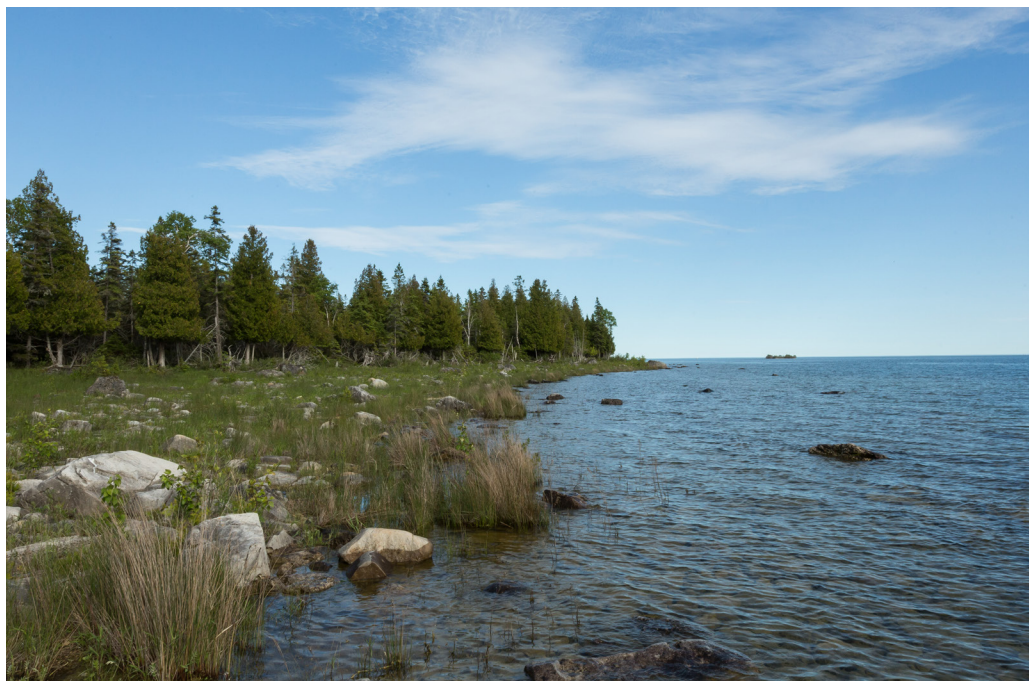
The Woollam Preserve features 4,300 feet of Lake Huron shoreline, home to rare species such as Michigan's state flower, the dwarf lake iris.

Help us keep track of the species at our preserves by using iNaturalist to record your observations. Learn more at nature.org/miexplore .