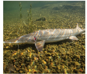
Pallid sturgeon

2 million acres of floodplains protected and restored by 2030