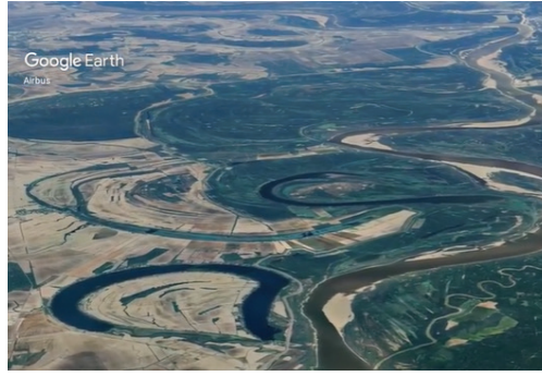
Hatchie-Loosahatchie Meander Scarp and Oxbow Lake