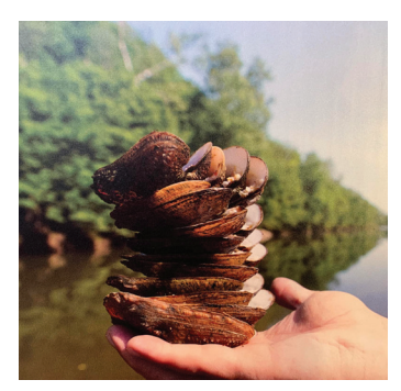
Freshwater mussels

In 2022, Sylvamo committed $1 million to supporting The Nature Conservancy's efforts to identify, conserve and enhance Appalachian Mountain lands and waters key to building a network of natural highways and neighborhoods where plant and animal species have the best chance of thriving in a changing climate. A portion of this gift is also helping TNC and partners sustainably manage and restore Appalachian forests, and identify opportunities where nature can serve as a solution to healthier lands, waters and communities.