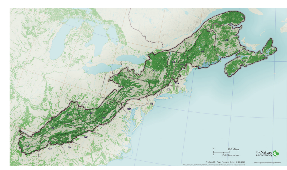
Appalachian Mountains

Visit nature.org/tngiving to support our efforts to conserve larger, globally important landscapes touching in Tennessee.