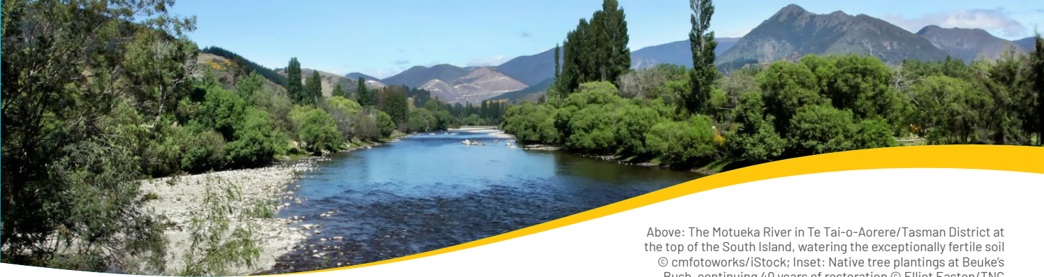
Above: The Motueka River in Te Tai-o-Aorere/Tasman District at the top of the South Island, watering the exceptionally fertile soil; Inset: Native tree plantings at Beuke's Bush, continuing 40 years of restoration