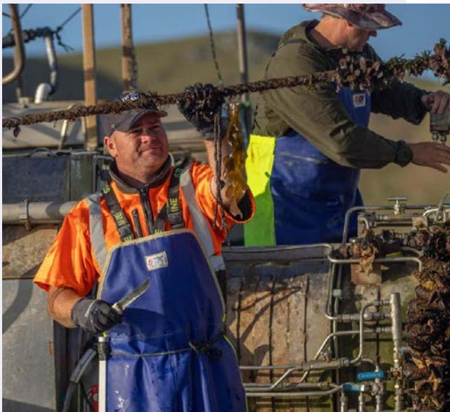
Above: Gathering kūtai for deployment to seed new kūtai beds ; Top right: Fishing boats moored near Oban, Stewart Island

Restoring the ocean through time, science and local leadership