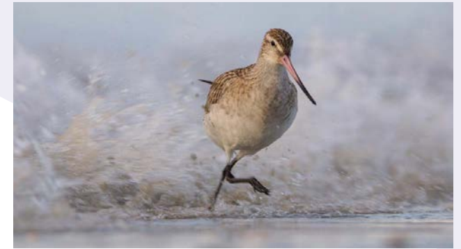
Above: Kuaka/bar-tailed godwit moves through the surf at Pūkoro/ro/Miranda; Left: Pūkoro/ro/Miranda's coastal wetlands are vital for thousands of migratory birds each year

Restoring coastal wetlands in New Zealand needs funding, practical examples and a stronger body of research. This year, we published a study from seven sites across 300 hectares showing that coastal wetlands could generate blue carbon credits that, when combined with other sustainable financing mechanisms,