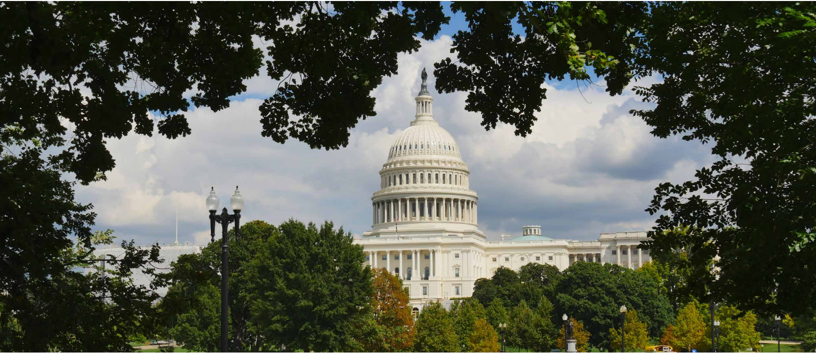
Tree canopy at the U.S. Capitol Building

Urban populations around the globe are growing rapidly. In the U.S. more than 80 percent of Americans now live in cities, and this percentage is projected to rise over the coming decade. Unfortunately, as urban populations increase, so do pressures on natural resources, including the one resource upon which all life depends: water. In Washington, D.C. these stresses are already apparent in the mounting challenges we face to absorb intense rainfalls, cool temperatures, and protect clean water. For example, 15% of the pollution affecting the Chesapeake Bay can be attributed to urban stormwater runoff.