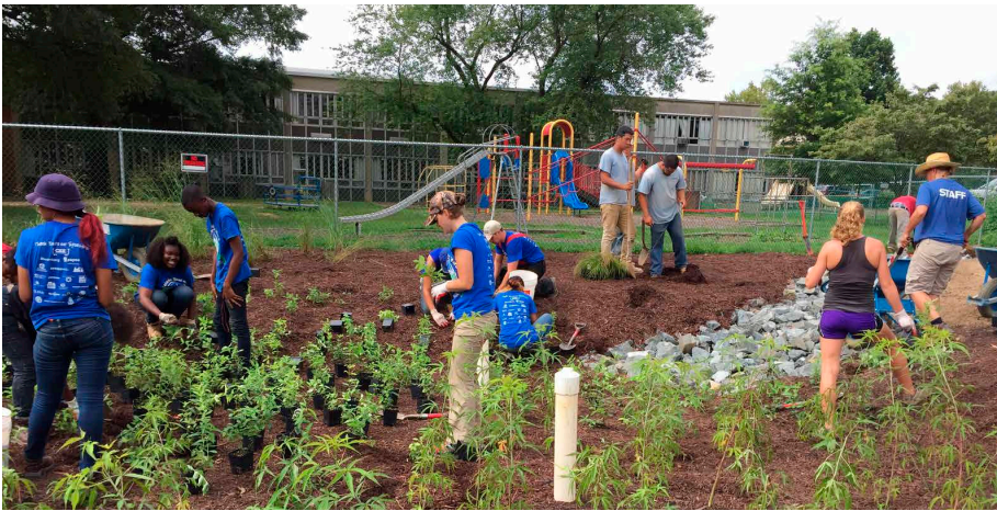
Volunteers plant a rain garden in D.C.

With your support, we will make D.C. a proving ground, demonstrating how nature in cities preserves our waterways, and generates benefits for communities, for people's health, and for the economy.