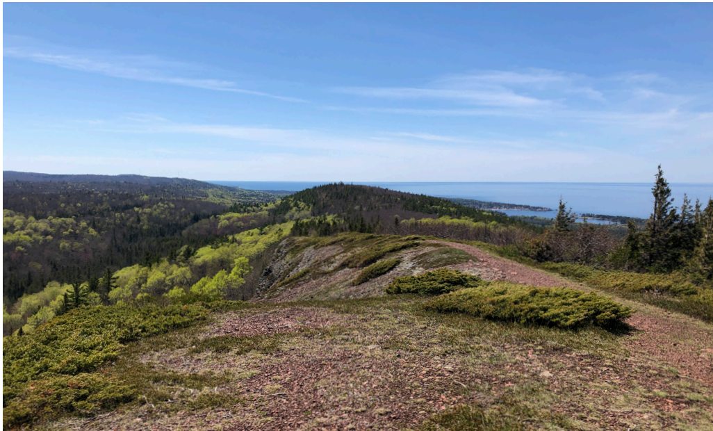
Northern balds, like the summit of Mt. Baldy, occur in Michigan only near Lake Superior, from Isle Royale to Gogebic County.

Get the insider's view of this preserve with a free self-guided tour on the TravelStorys app! To learn more, visit nature.org/miexplore .