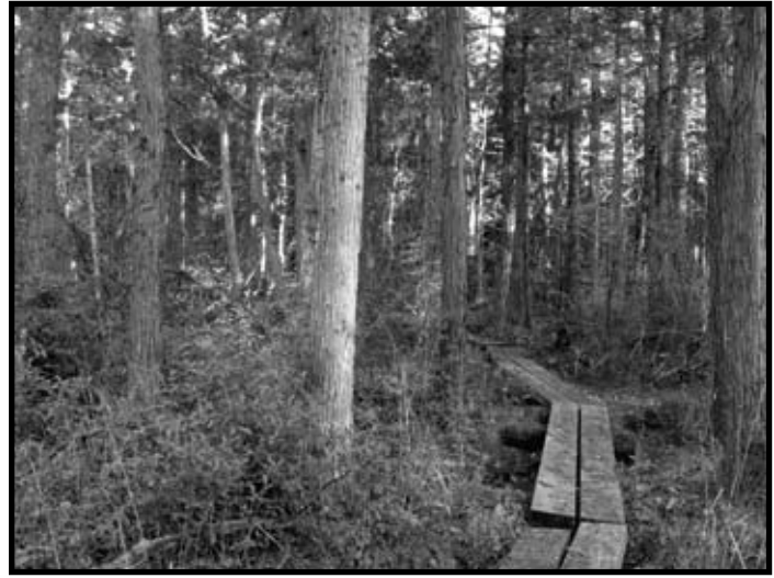
A boardwalk leads the way through the cedar swamp.

A lichen study at the site revealed a number of species that are indicators of high air quality and lack of disturbance. This is largely due to the extensive intact woodland that surrounds and buffers the swamp. Another study examined the pollen in peat core samples and determined that cedar has been present in this location for over 4,000 years, indicating that the site has excellent long-term viability. Loverens Mill is an extremely important habitat, and the establishment of this preserve in January of 1999 fulfilled a long-standing goal of The Nature Conservancy of New Hampshire.