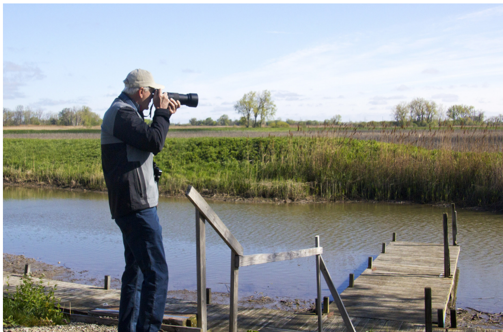
The Erie Marsh Preserve was donated to TNC by the Erie Shooting and Fishing Club and retained several buildings on the property for club members' use. The preserve is still open to the public for hiking and birding eight months of the year.

Help us keep track of the species at our preserves by using iNaturalist to record your observations. Learn more at nature.org/miexplore .