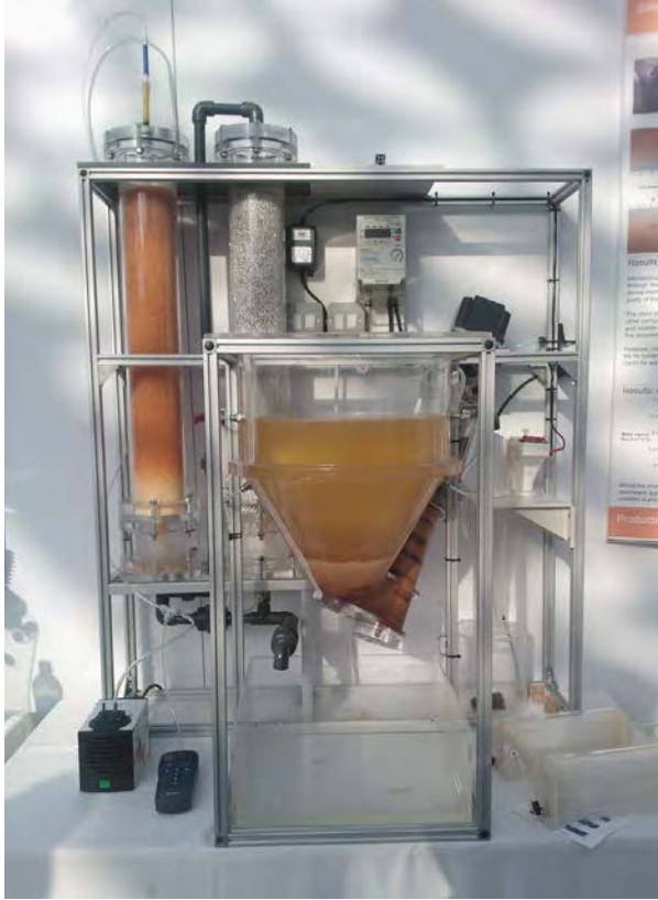
Solid-liquid separation and diffusion of water through hydrophobic membranes in the front unit.