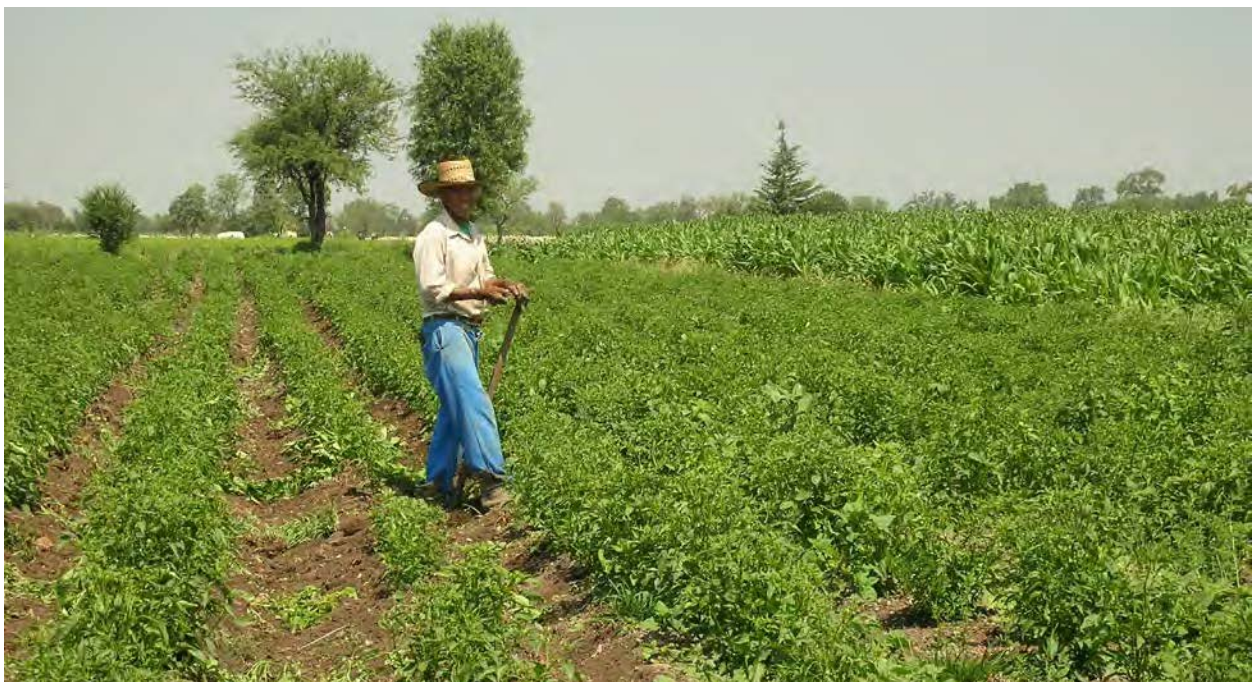
Chili with wastewater © SuSanA Secretariat_Flickr_CC

The high capital and operational costs associated with building and maintaining reuse infrastructure, especially advanced treatment systems for potable or industrial applications, inhibit widespread adoption. Even where treatment facilities exist, the lack of clear tariff structures and poor cost-recovery mechanisms make operations financially unsustainable. 29 For example, Namibia has successfully implemented direct potable reuse for decades, yet replication remains limited due to the high cost of treatment and the need for specialized monitoring and staffing. 30