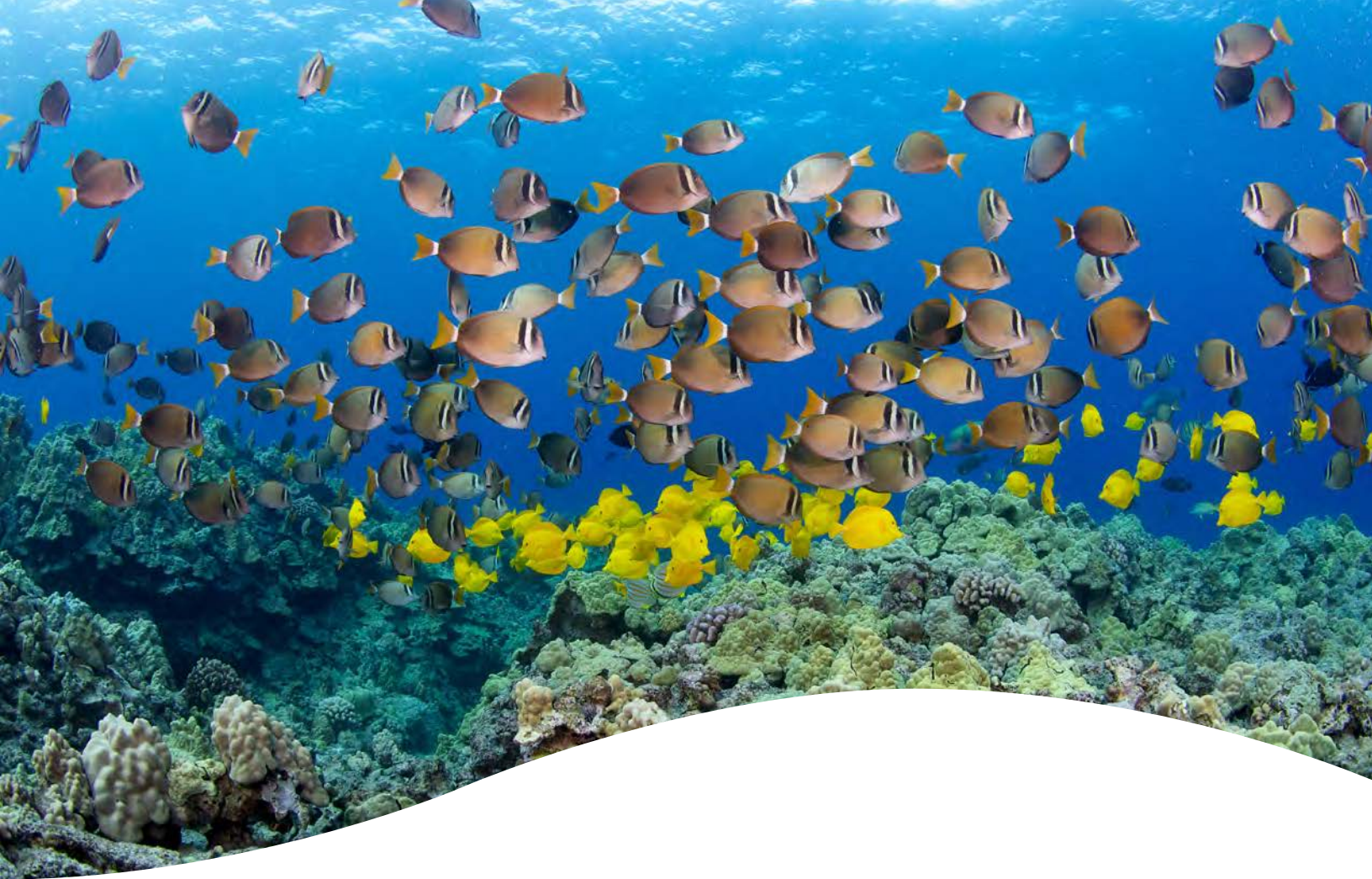
Ka'upulehu West Hawaii