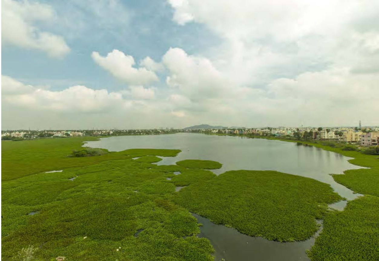
Lake Sembakkam