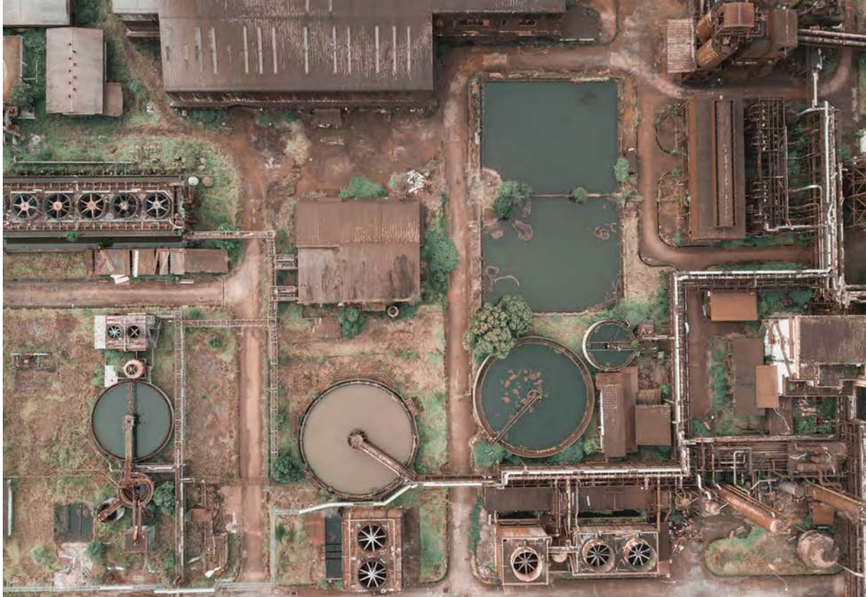
Purification tanks of old wastewater treatment plant

marine conservation or coastal climate resilience planning. This disconnect undermines cross-sectoral synergies, particularly in areas with coastal urban populations and coral reef systems.