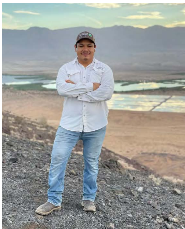
Arenitas Wetlands