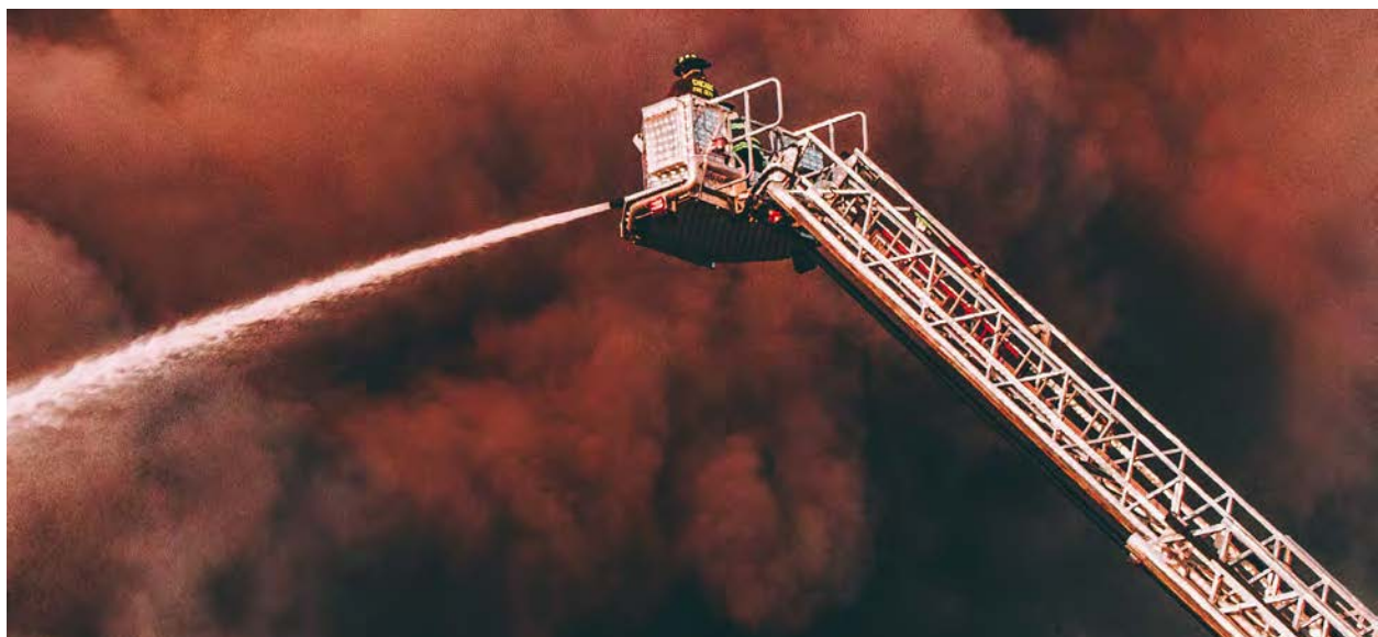
Fire suppression

Even with regulation and planning alignment, reuse will not scale without viable financing mechanisms. Blended finance models, long-term municipal bonds and performance-based funding can help unlock capital. 100 In Brazil, the PRODES program reimburses municipalities based on verified performance of wastewater treatment, incentivizing long-term O&M. Durban, South Africa, pioneered an industrial reuse public-private partnership that offset public costs through commercial offtake agreements. 101 In India, urban reuse is increasingly supported under AMRUT 2.0, though tariff reforms are still needed for financial sustainability. 102