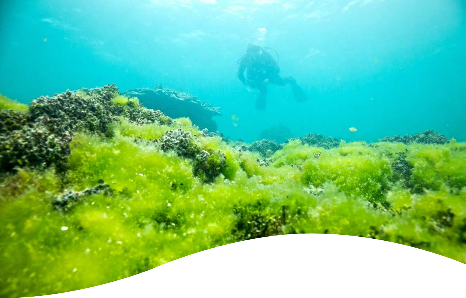
Lisianski Algal Bloom on Bleached Coral