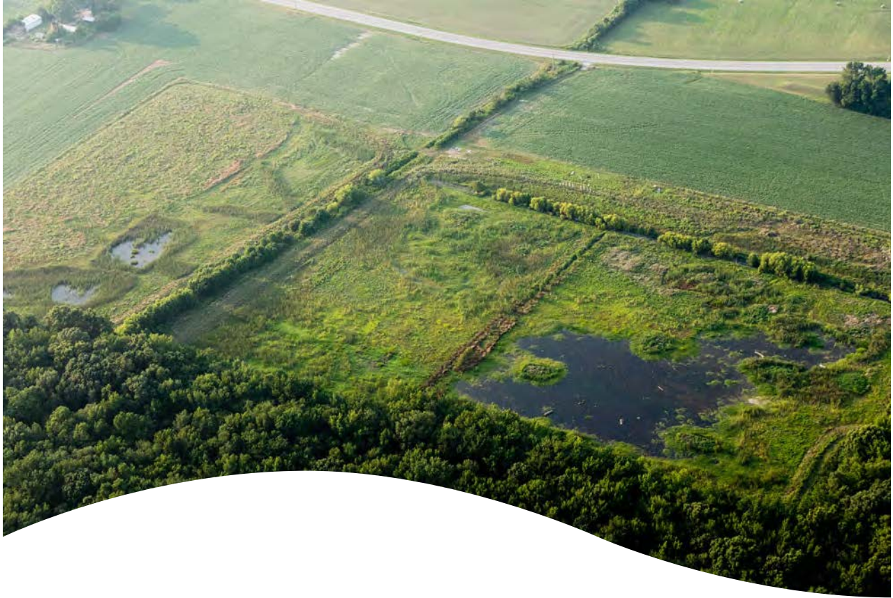
Restored wetlands on a farm in Queen Anne's County, Md.

ecological function. Reused water, when appropriately treated, becomes a valuable resource that is capable of offsetting demand for freshwater in agriculture, industry and even urban green infrastructure.