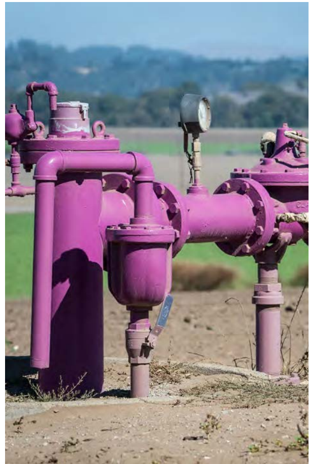
Purple pipes for water reuse

In 2020, Florida's Potable Reuse Commission released a consensus-based Framework for Potable Reuse, 40 which was based on 18 publicly noticed stakeholder workshops involving regulators, utilities,