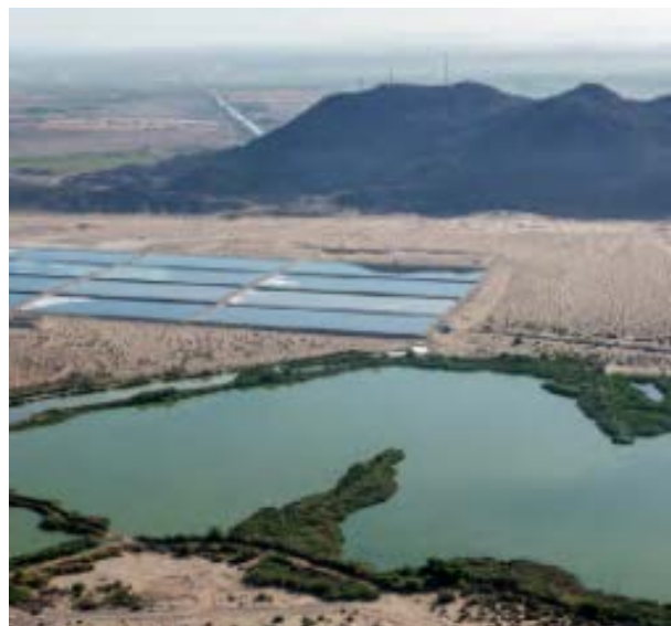
Arenitas treatment wetlands

In 2019, a binational agreement between the U.S. and Mexico, Minute 323, created a framework for restoring the Delta by combining public and private investment. A major strategy under this framework