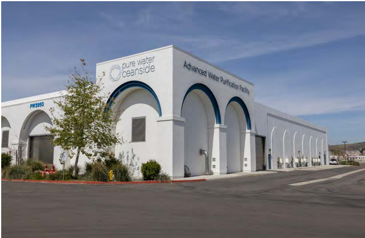
Pure Water Oceanside Project

Progress: Projects that demonstrated stronger outcomes typically featured fit-for-purpose reuse planning (e.g., tertiary treatment for irrigation or groundwater recharge), strong alignment with local or regional policy frameworks, and continued stakeholder engagement, particularly in monitoring and adaptive management. A recurring theme across successful cases was adaptive design, the ability to respond to shifting policy landscapes, community needs or technological constraints. In addition, project champions cited the importance of early-stage co-development with regulators and the presence of enabling institutional anchors, such as city water boards or municipal wastewater departments.