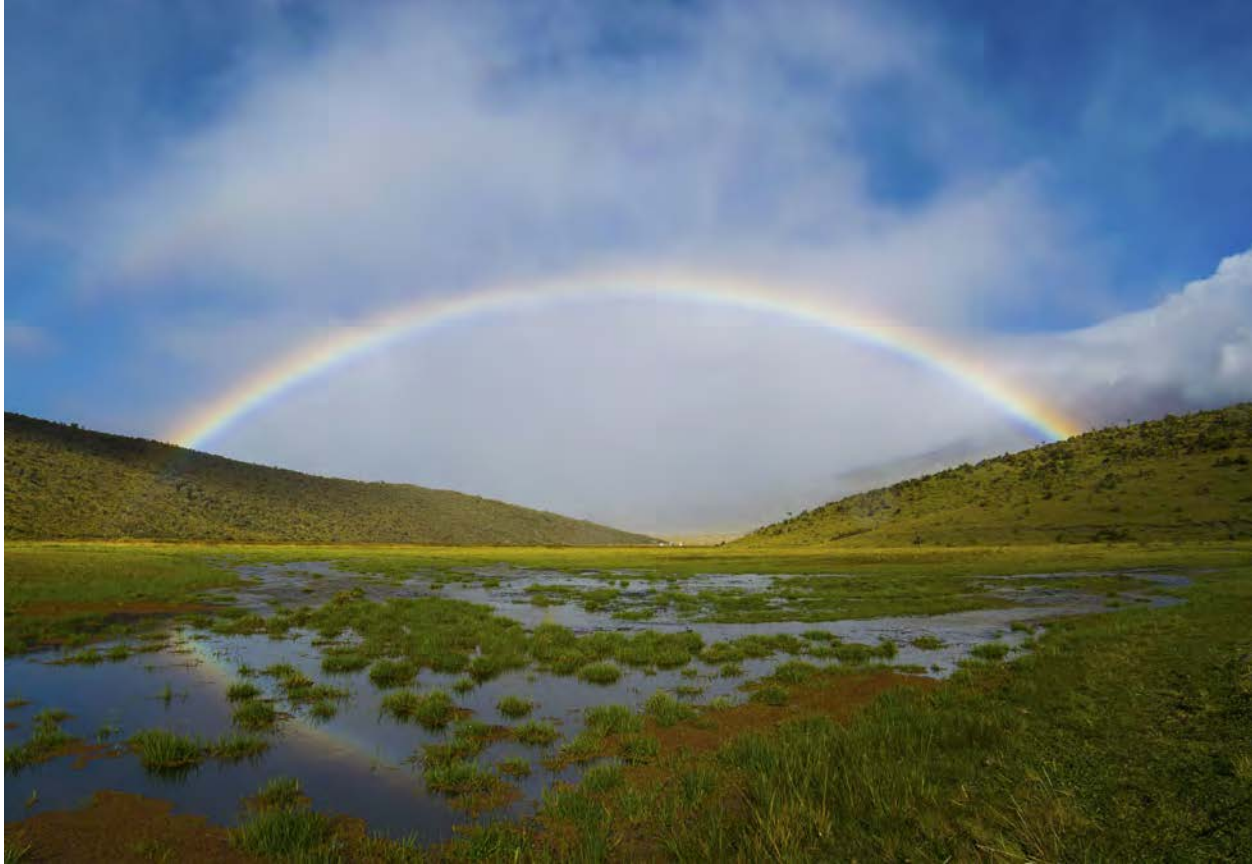
Limpiopungo, Cotopaxi