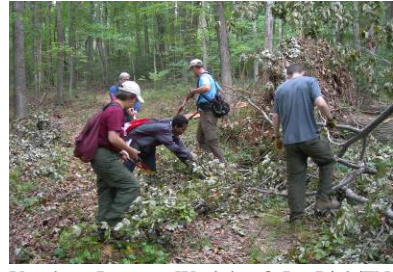
Voorhees Preserve Workday