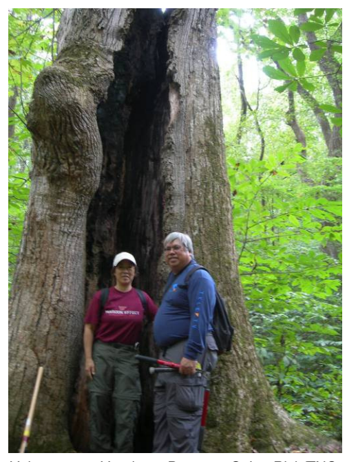
Volunteers at Voorhees Preserve

Being a Volunteer Visitation Committee Member for The Nature Conservancy gives you the opportunity to help protect critical habitat for plants and animals that is quickly disappearing. Members will gain valuable experience in the field and have the opportunity to increase leadership skills.