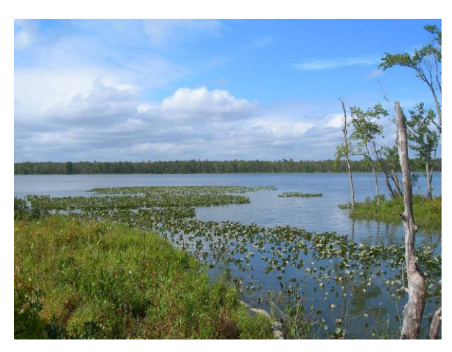
Voorhees Preserve

The Conservancy has protected more than 7,500 acres in the Chesapeake Rivers region, has established two new state forests in the project area, has added 3,000 acres to the Rappahannock River Valley National Wildlife Refuge and has protected more than 3,700 acres along Dragon Run.