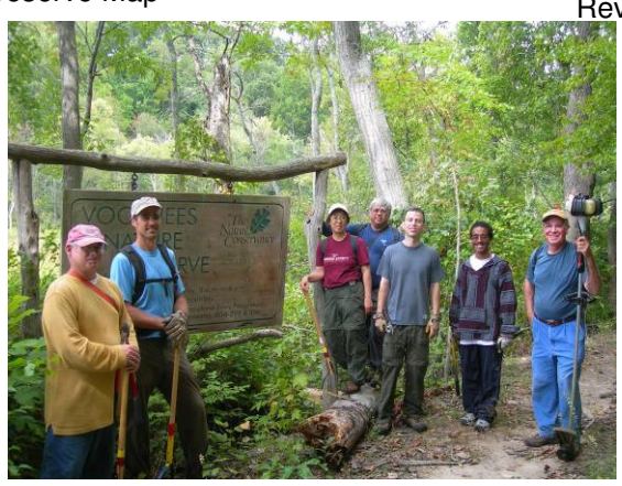
Voorhees Preserve

THANK YOU for deciding to help maintain and monitor Voorhees Preserve. Volunteers make it possible for the Conservancy to continue protecting nature and preserving life.