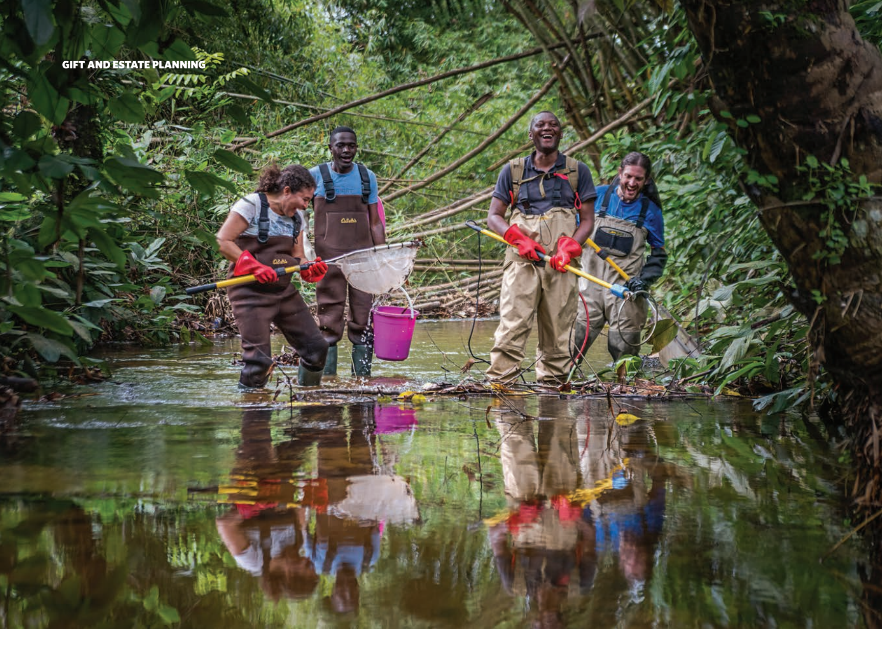
CONNECTED CONSERVATION: As TNC's Nature Bonds protect Gabon's oceans, deep in the country's rainforest TNC-supported scientists study freshwater species to inform their protection, too (above).