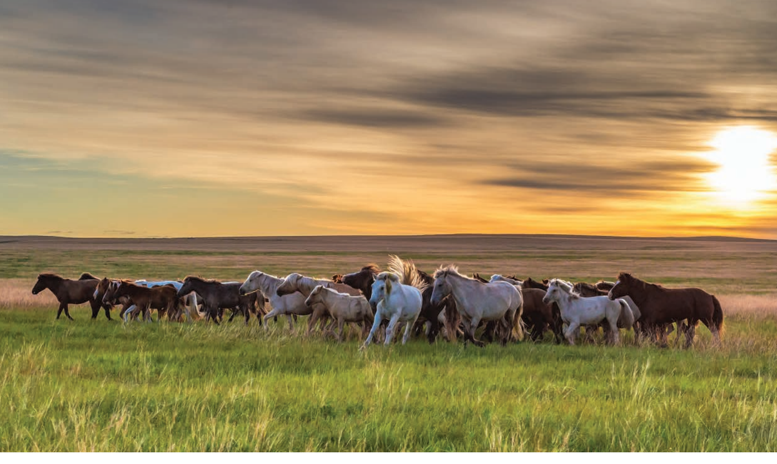
FINDING A WAY: From the plains of Mongolia (above) to the depths of British Columbia's Great Bear Sea (below), partnerships on the ground and in the water bring TNC closer to our ambitious 2030 Goals.

We are proud to share this 2023 annual report with you. We're also eager to hear from you. Please take a moment to share your insights by completing the survey, linked on page 2 of this report.