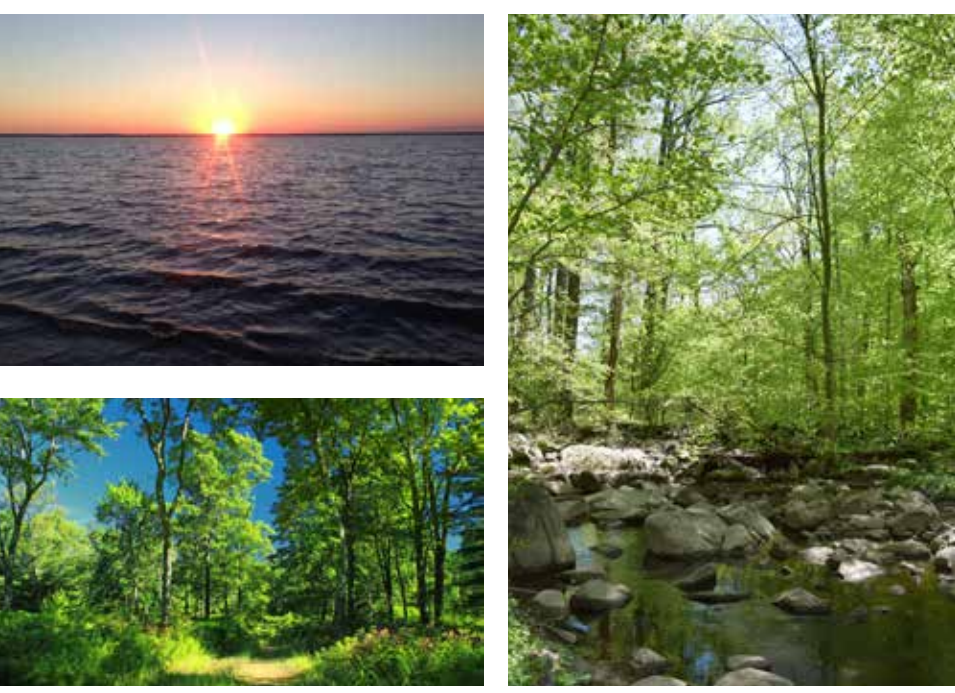
Top: Sunset over Rehoboth Bay ; Bottom: A hiking trail on the West Branch Forest Preserve. Right: Beaver Creek in the Brandywine Valley unit of First State National Historical Park.