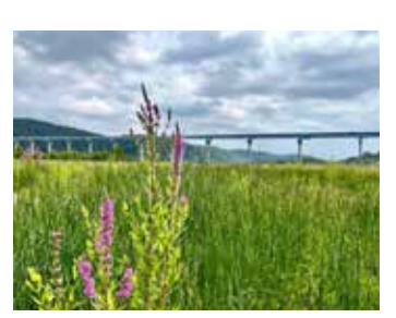
Lock 12 Recreational Area