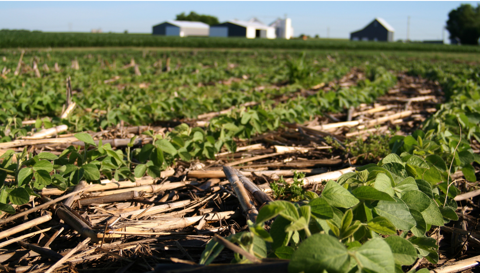
This no-till soybean crop is off to a great start with high organic matter from last year's corn.

USING REMOTE SENSING DATA TO MAP CONSERVATION AGRICULTURE PRACTICES