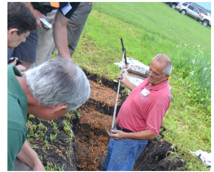
Field measurements help to validate remote sensing data.

This project is supported by the Foundation for Food and Agricultural Research, United States Department of Agriculture, Bayer Crop Science, DuPont Pioneer, Enterprise Rent-A-Car, Monsanto, Mosaic, J.R. Simplot Company, Syngenta, the Walmart Foundation and The Nature Conservancy.