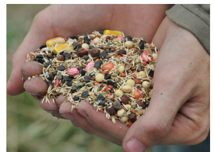
Multiple cover crop species help to improve soil health and overall production capacity.

While OpTIS calculations are performed and validated at the farm-field scale using publicly available remotely sensed data, the privacy of individual producers is fully protected by reporting only spatially-aggregated results at much larger scales (i.e., HUC 8 watershed and USDA Crop Reporting District).