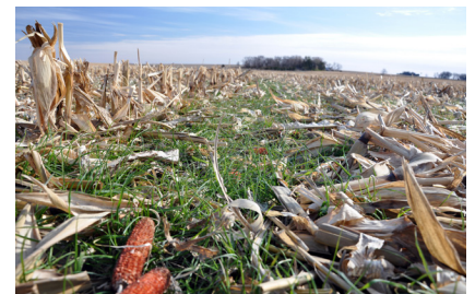
An aerial-applied rye grass cover crop grows between harvested corn rows in southwest Iowa.