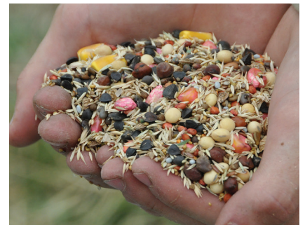
Multiple cover crop species help to improve soil health and overall production capacity.