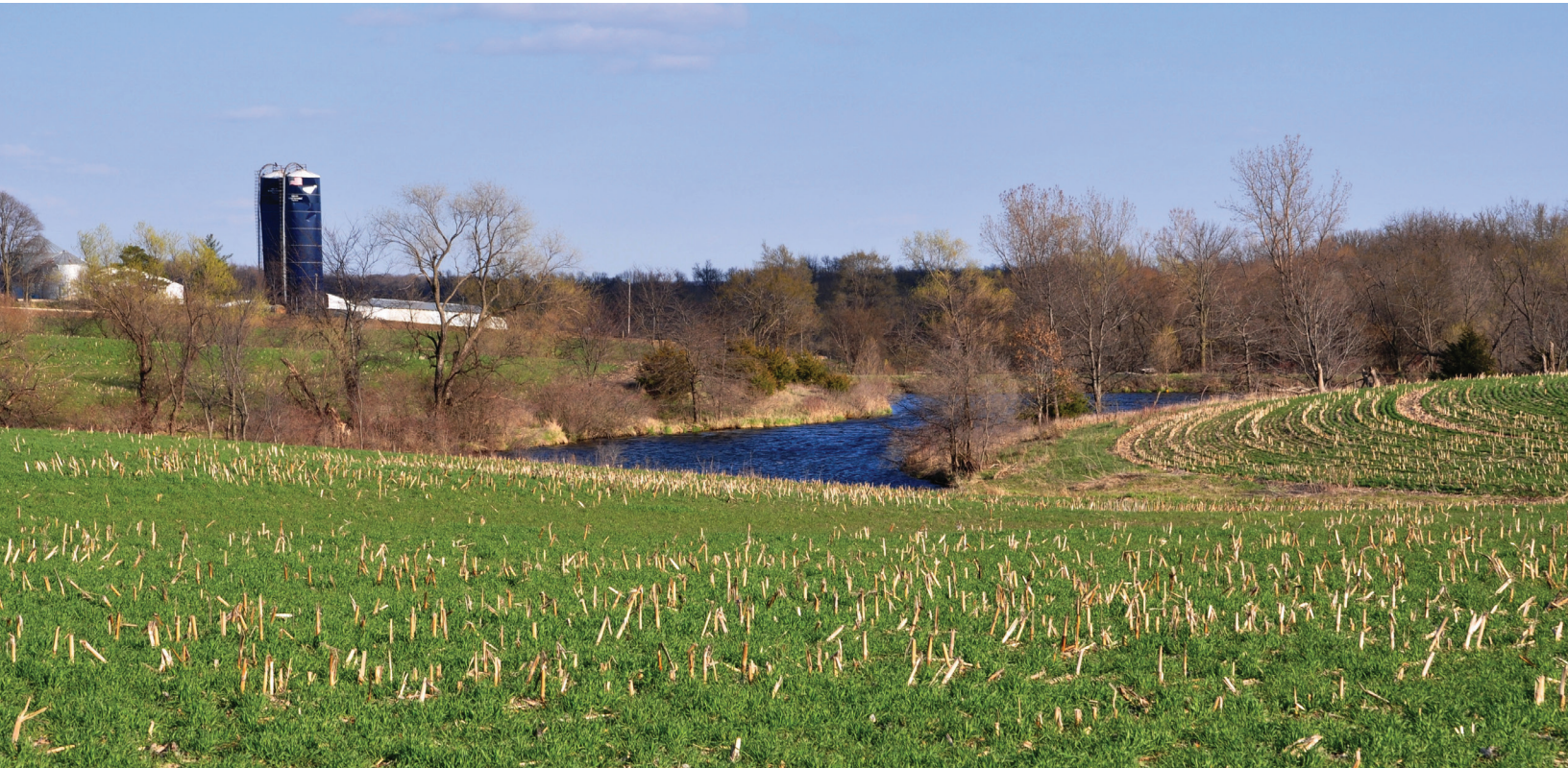
Cereal rye cover crops have been planted into corn on this Iowa farm.

USING REMOTE SENSING DATA TO DRIVE CONSERVATION AGRICULTURE SOLUTIONS