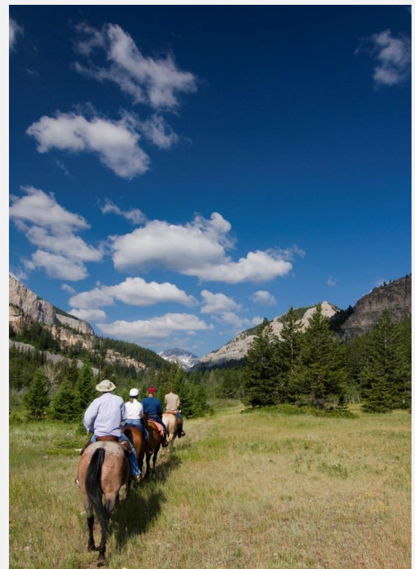
PINE BUTTE LODGE Nestled in the foothills along the Rocky Mountains and along the South Fork of the Teton River.