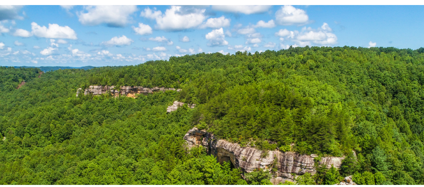
The McCreary County property is adjacent to the Big South Fork National River and Recreation Area.