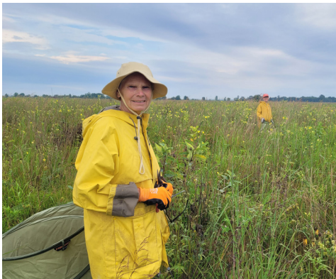
We are so grateful for our volunteers who bring passion, experience and commitment to help with bird, butterfly, and moth monitoring, prescribed fire, tree removal, seed harvest, green-house work, newsletter mailings, trail clearing, garbage clean-up, data entry, land management, equipment and signage maintenance, photography, leading field trips and serving in the role of Bison Rangers. Thank you, volunteers!