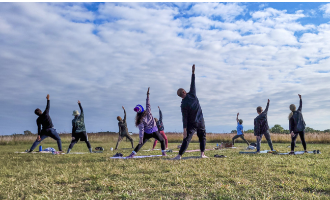
Attendees enjoy sunrise yoga on the prairie, one of the activities at Kankakee Sands' 25th anniversary celebration.

Please join us for these upcoming 2023 events with our partners Friends of the Sands, Newton County Park Board and Newton County Public Library!