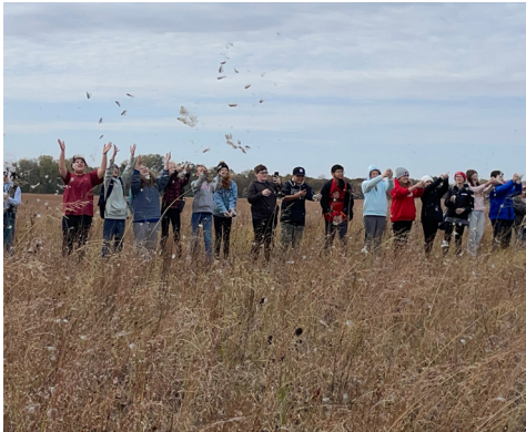
In 2022, 400 area students visited Kankakee Sands for free field trips to experience the prairie and bison, like these south Newton 6th graders releasing milkweed seeds onto the prairie.

TNC strives to connect more people in Indiana to nature. At Kankakee Sands, we take that mission to heart. Whether it’s leading volunteer workdays, hosting school groups, or partnering with local organizations on outreach activities—we are all in!