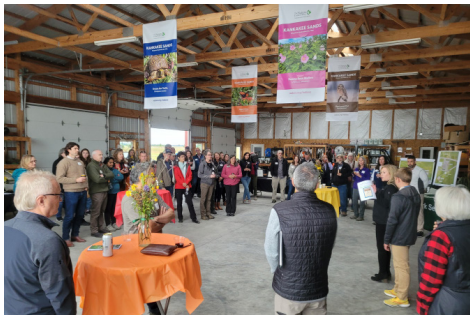
TNC trustees, staff and conservation partners celebrate 25 years of conservation at Kankakee Sands.

In September, we celebrated Kankakee Sands' 25th year! TNC trustees, staff, conservation partners and the local community came to celebrate all that we have done together: 8,000 acres planted to prairie with more than 600 species of native plants and in doing so, connecting Beaver Lake Nature Preserve, Conrad Station Savanna and Willow Slough FWA for 20,000 acres of contiguous protected habitat. On those acres now roam badgers, butterflies, birds and bison! Thank you to everyone who was able to come out and celebrate this day with us, including all the volunteers who helped make the weekend a success.