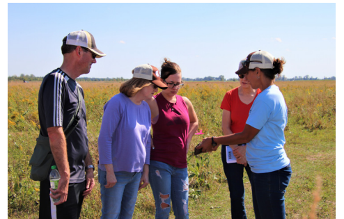
Discussing and admiring a bison paddy during the South Pasture Bison Tour.