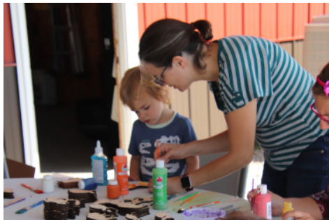
Painting wooden bison, butterflies and turtles to take home as a memory from our 25th Anniversary Celebration.