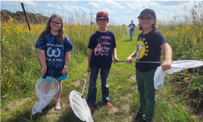
Capturing monarchs for tagging during the Monarch Watch program in partnership with Friends of the Sands