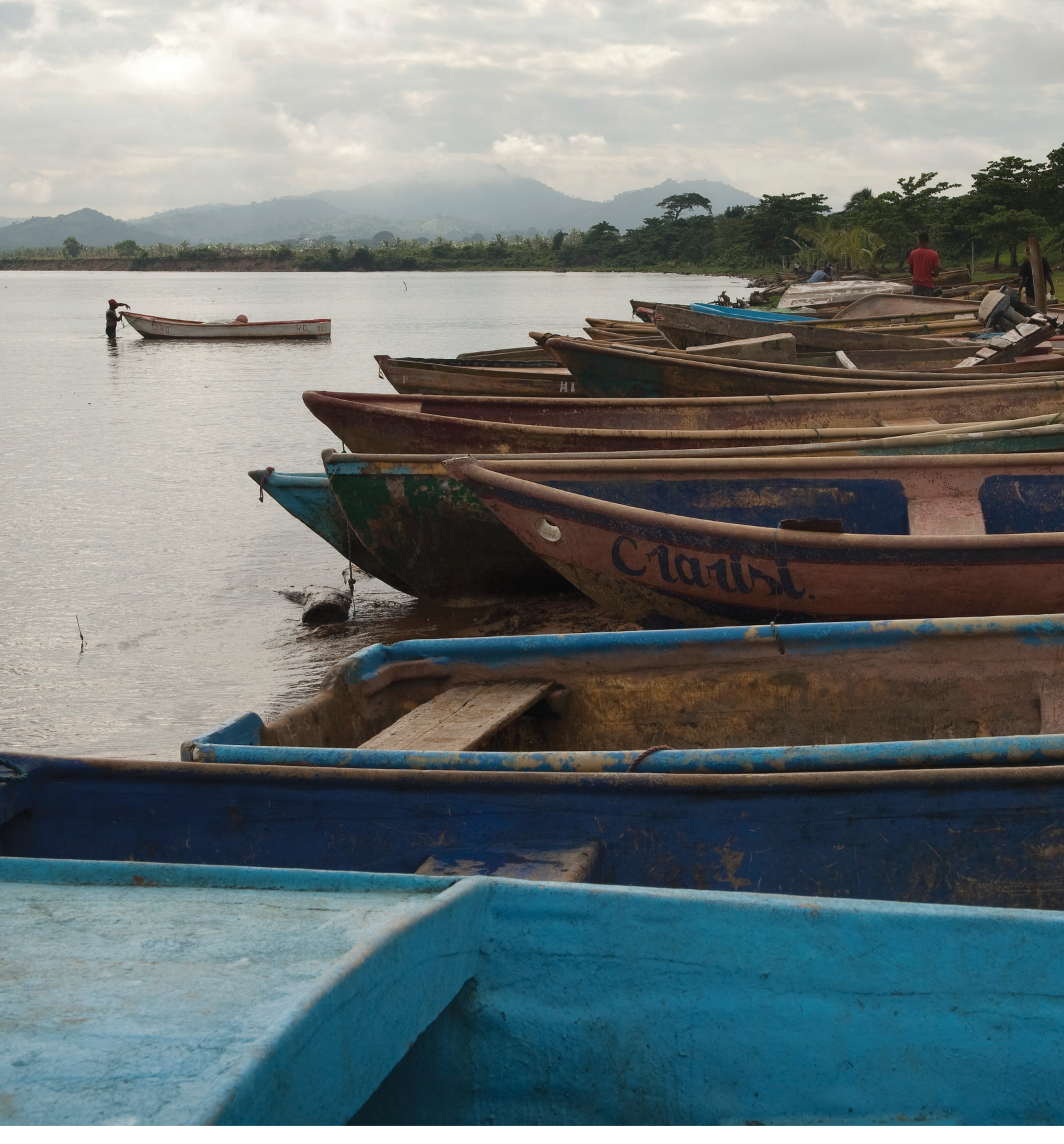
Fishing boats line a shore on the south coast of Samaná Bay, Dominican Republic