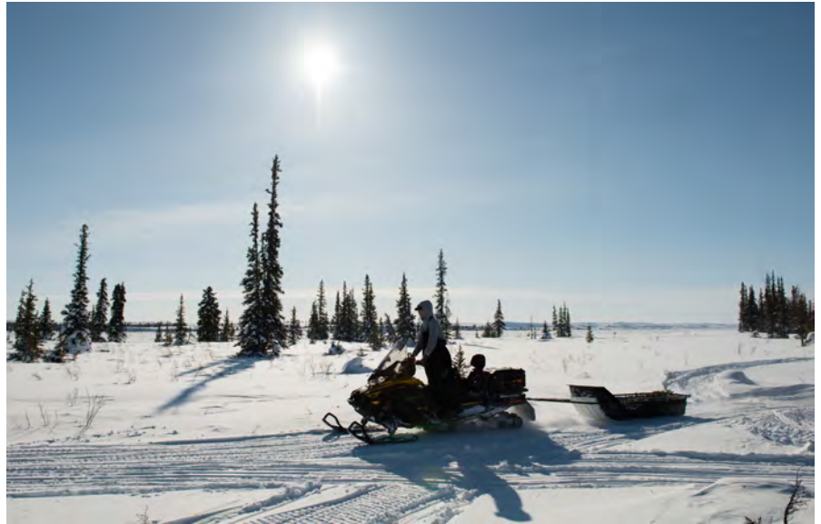
Our partnerships with Indigenous Nations have been incredibly formative in our journey toward right relations.