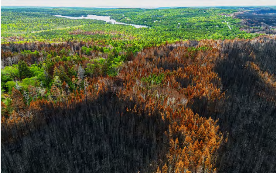
Extreme wildfires are directly connected to more dry weather, which has increased over the last decade.