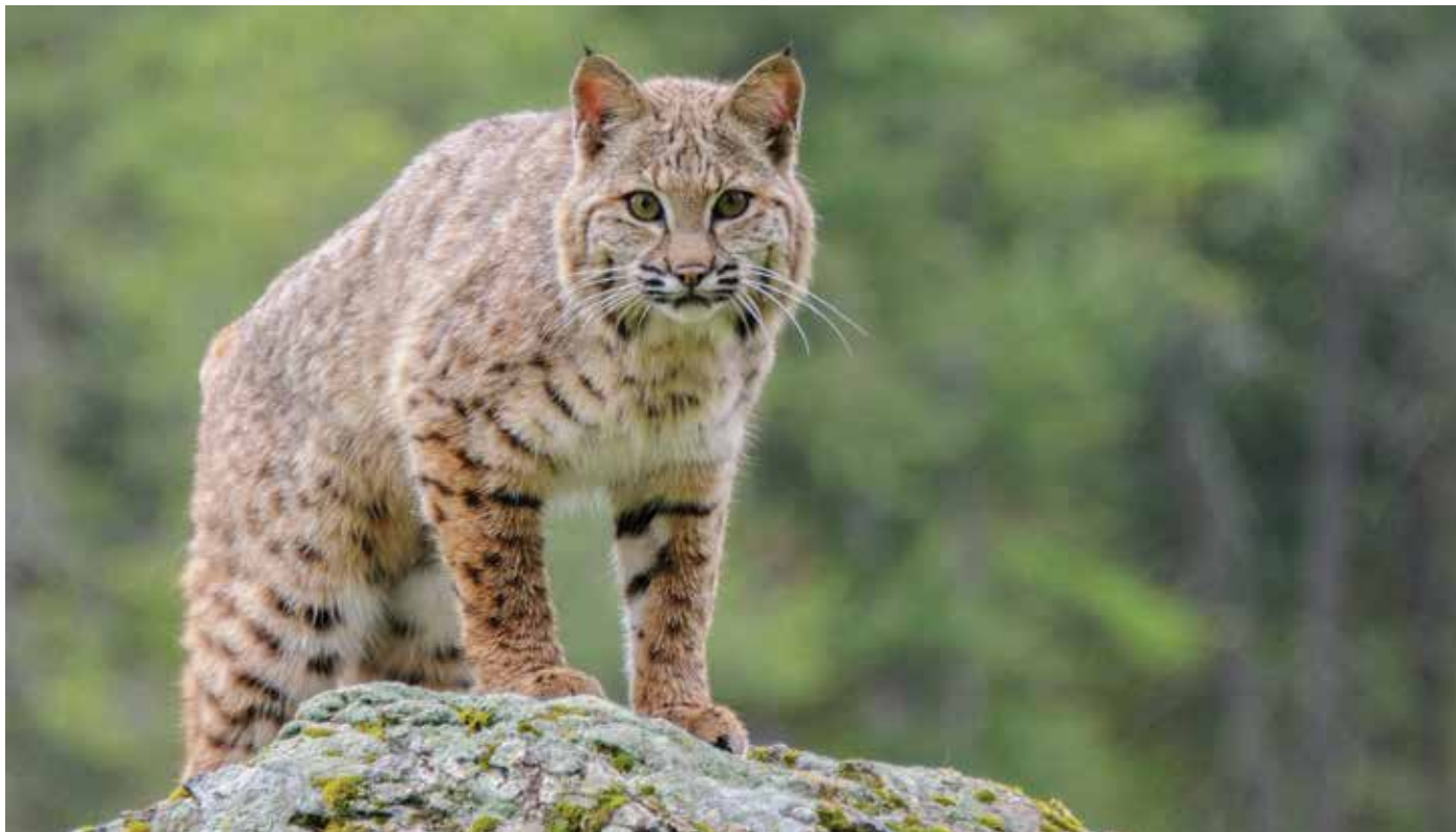
The Appalachian Mountains are one of four key priority areas whose protection can help meet our goal of conserving 30 percent of lands and waters by 2030. However, we still have work to do: so far, only 19 percent of New York’s Appalachians are protected—leaving local wildlife species, like this bobcat, vulnerable.

People and nature thrive when we work together. Preserving intact forests, building wildlife underpasses and saving crucial connections in the Appalachians will benefit all of us who call this land home.