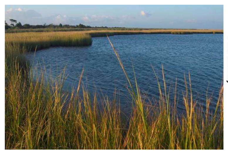
The Nature Conservancy's Volgenau Virginia Coast Reserve (VVCR) is comprised of 14 undeveloped barrier islands, thousands of acres of pristine salt marshes, vast tidal mudflats, shallow bays, and productive forested uplands.