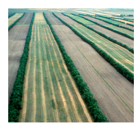
Windbreaks: Linear planting of trees and shrubs to reduce wind speed, preventing soil erosion, and protecting crops.