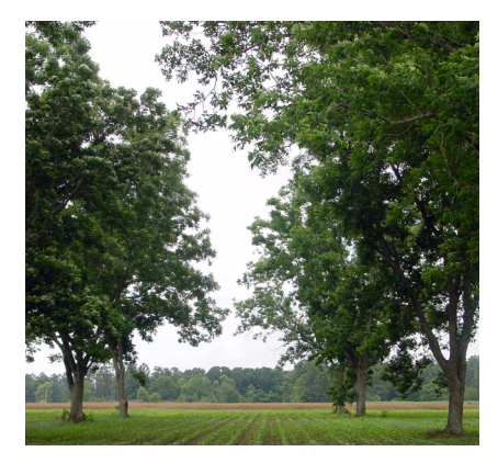
Alley Cropping: Planting rows of trees to create alleys where crops are grown.

This project will focus on the following types of agroforestry plantings: