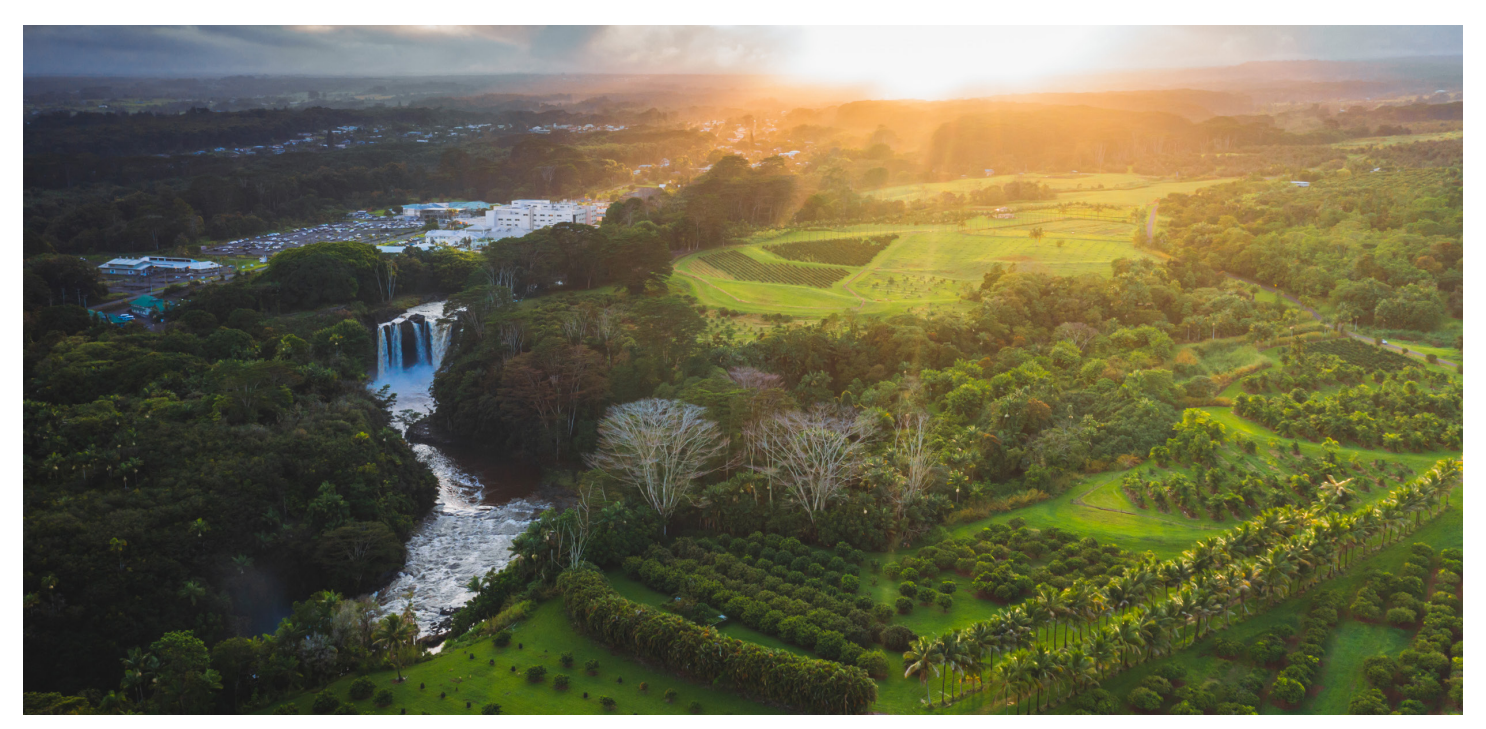
Agroforestry helps increase producer's income, while mitigating climate change. Agroforestry in Hawai'i

FOR PRODUCER PROFITABILITY AND CLIMATE STABILIZATION