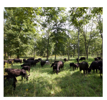
Silvopasture: Integration of trees and grazing livestock operations on the same land