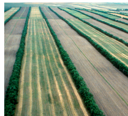
Windbreaks: Linear planting of trees and shrubs to reduce wind speed, preventing soil erosion, and protecting crops.