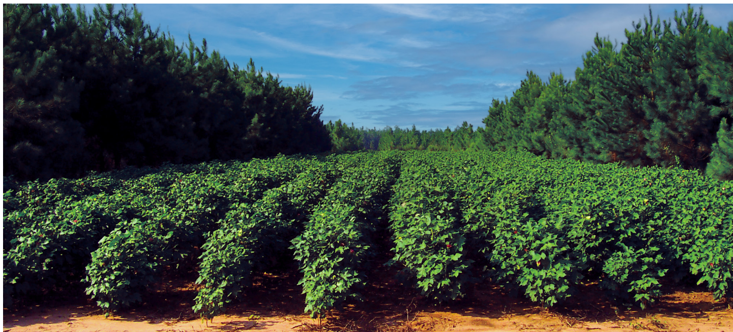
Cotton grows between rows of pine trees.

FOR PRODUCER PROFITABILITY AND CLIMATE STABILIZATION