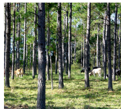
Silvopasture: Integration of trees and grazing livestock operations on the same land.