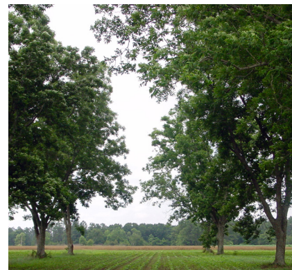
Alley Cropping: Planting rows of trees to create alleys where crops are grown.

This project will focus on the following types of agroforestry plantings: