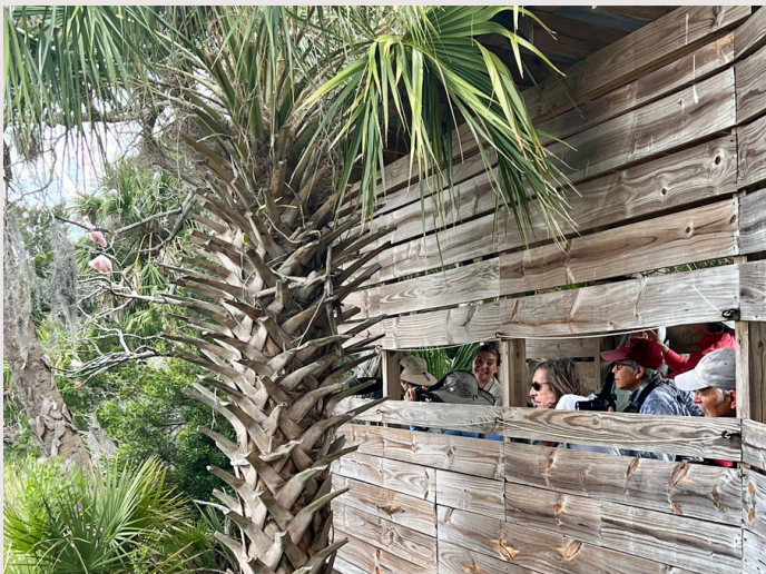
Photos: Sunset on Little St. Simons Island, GA © Marc Del Santoro; Bird Blind, Little St. Simons Island, GA © Erin Crowther/TNC

Its wetlands, woods and shell-strewn coastline beckon exploration by foot and kayak. A prime spot for bird-watching, it offers close-up views of migratory birds feeding in the morning shadows and surf. Whether you paddle through tidal creeks and salt marshes or stroll through maritime forests with moss-draped oaks, you'll be certain to enjoy this incredible retreat.