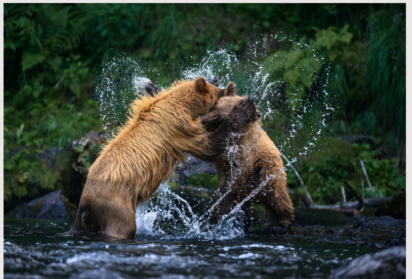
Photos (left to right): Alaskan Glacier; Brown Bears in the Kenai Peninsula, AK

As we end our time together, shuttles to Anchorage International Airport will be offered beginning at noon. Earlier or later departures can be accommodated through The Lakefront Anchorage's 24/7 shuttle service.