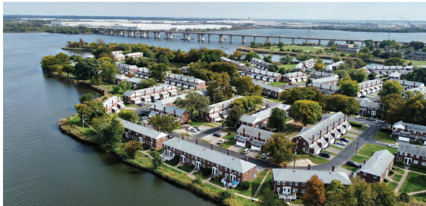
Climate justice communities like Turner Station, Maryland often lack the capacity and expertise to apply for climate adaptation funding. Projects like SEAFARE and COEF are intended to provide policymakers with the necessary tools to better support these types of frontline communities.