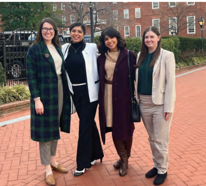
LEFT TO RIGHT: THIS PAGE, TOP: BOTTOM: The Maryland/DC chapter's government relations team attends Maryland's 2024 General Assembly.

This year, our climate adaptation policy staff completed two projects: Supporting Equitable Access to Funding for Adaptation Resources (SEAFARE), and Community Outreach and Engagement Forums (COEF). These reports and toolkits build on each other to provide policymakers with a set of recommendations for improving the flow of climate adaptation funding and resources. They were created in close partnership with frontline communities so that the recommendations put forth are rooted in equity, authentic relationships and community-led planning. These projects now lay the groundwork for the important climate adaptation work that TNC and the state of Maryland will be advancing in the years to come.