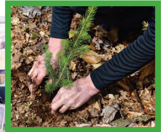
LEFT TO RIGHT: Volunteers prepare to plant red spruce trees in an effort to restore native forests at Cranesville Swamp preserve. Staff represent TNC at the 2024 Appalachian Festival hosted by Frostburg State University. A volunteer carefully places a red spruce seedling in the ground during our Cranesville Swamp volunteer event.