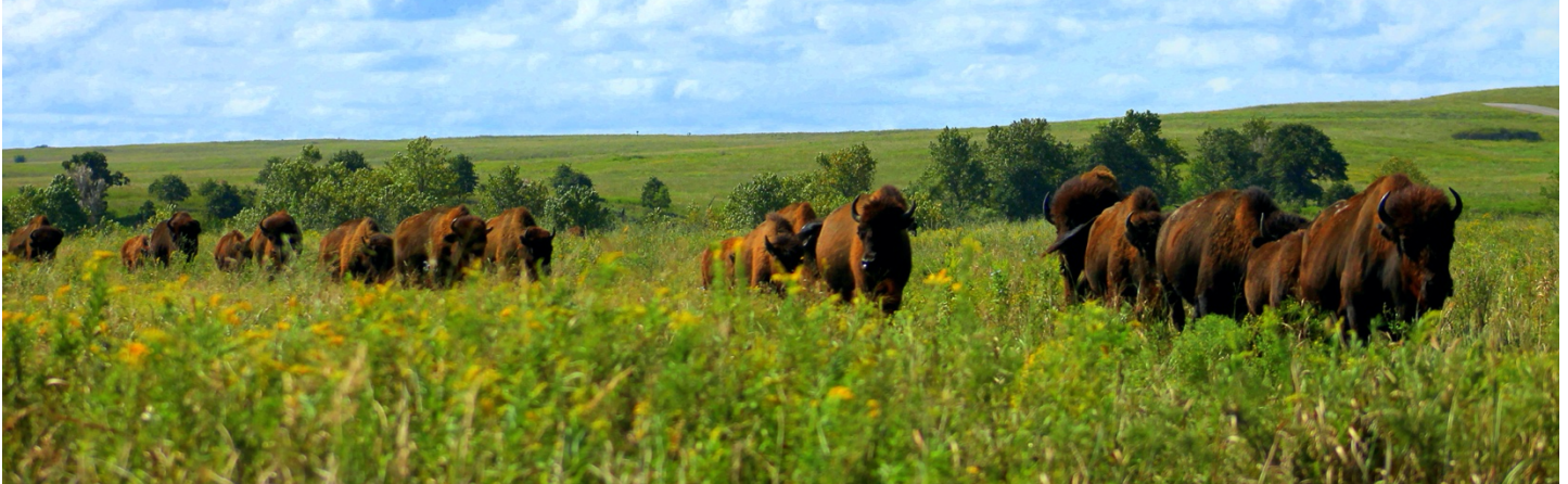
Bison at the Joseph H. Williams Tallgrass Prairie Preserve in Pawhuska.

Sustaining healthy natural systems that are the foundation for our economy, security and way of life by building on Oklahoma's nonpartisan conservation tradition.