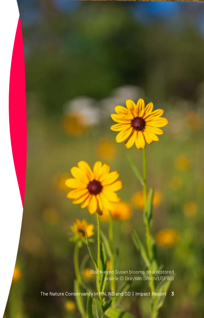
Black-eyed Susan blooms on a restored prairie