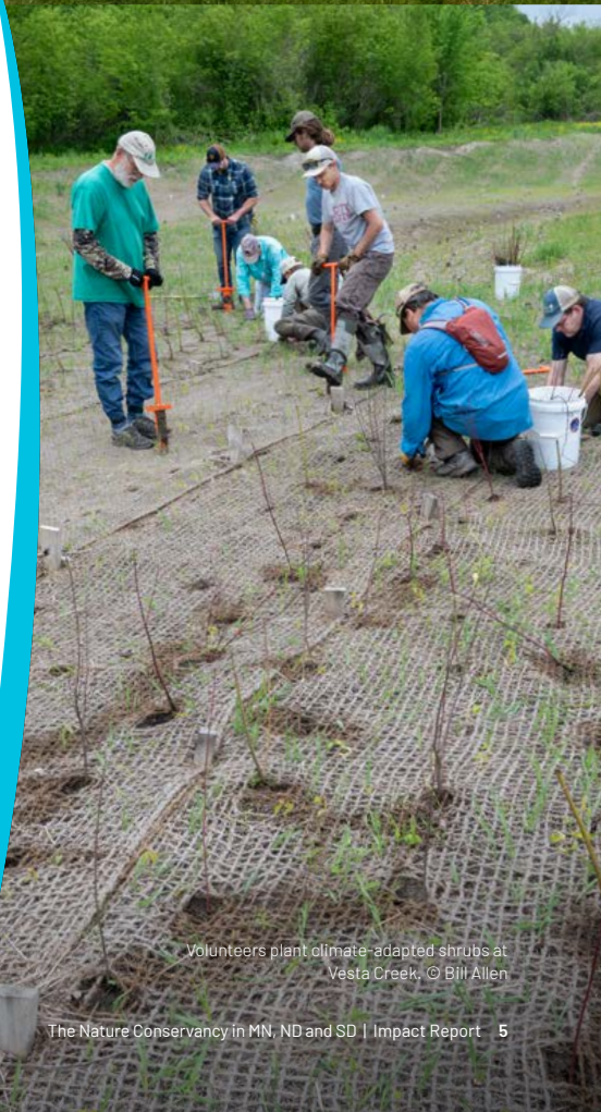
Volunteers plant climate-adapted shrubs at Vesta Creek.