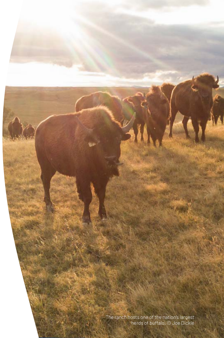
The ranch hosts one of the nation's largest herds of buffalo.

TNC also partners with InterTribal Buffalo Council (ITBC) and Tanka Fund on an Indigenous-led initiative to return buffalo to ancestral grazing lands. Buffalo—a keystone species in grasslands—play a crucial role in spiritual and cultural revitalization, ecological restoration and conservation, food sovereignty, health and economic development for Indigenous Peoples. Since 2020, these partnerships have facilitated the return of more than 2,300 buffalo to ITBC Member Nations and Tanka Fund caretakers.