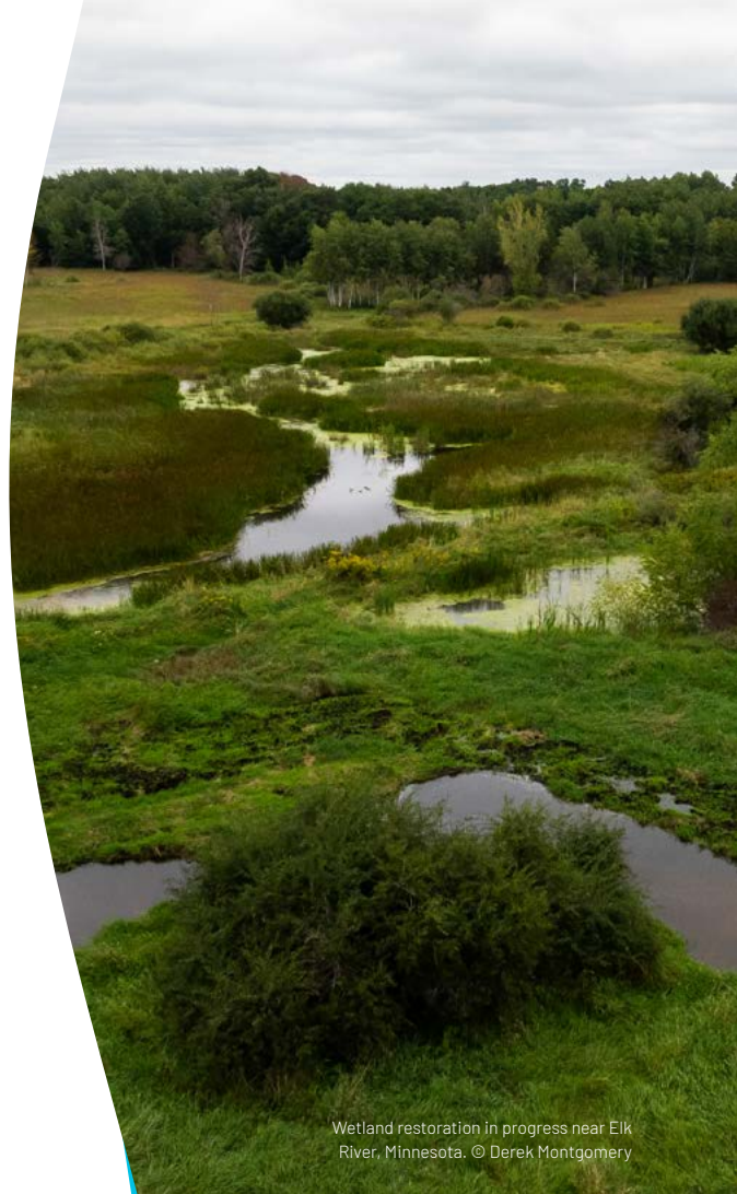
Wetland restoration in progress near Elk River, Minnesota.

This year, our team helped train a new generation of conservation agronomists at farmer co-ops. They are advising farmers on changes to their operations with both agronomic and environmental benefits. And our approach is spreading. Other co-ops across the state have hired conservation agronomists of their own, proving that Minnesota's farmers have an appetite for restorative practices.