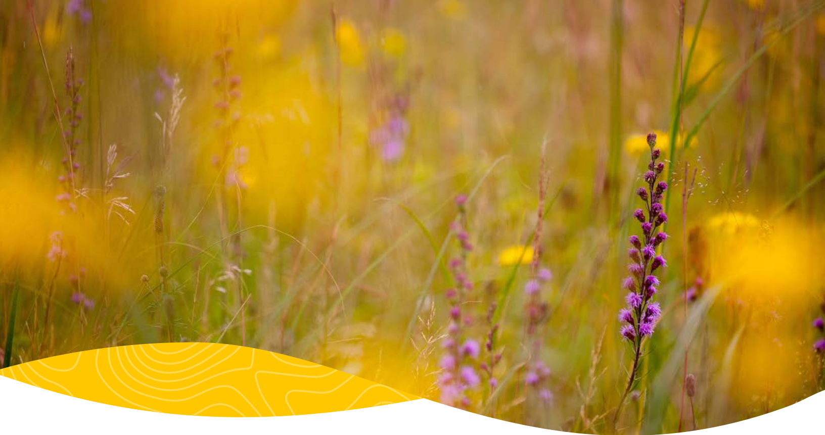
Blazing star blooms at the Bluestem Prairie Scientific and Natural Area in Clay County, Minnesota.