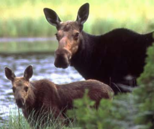
A cow moose with a calf

Visit nature.org/tristateimpact to make a gift.