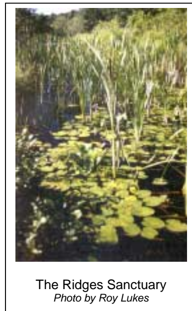
The Ridges Sanctuary

P.O. Box 152 Baileys Harbor, WI 54202-0152 920.839.2802 www.ridgesanctuary.org