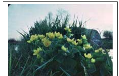
Marsh Marigolds

Wisconsin Coastal Management Program. 1995. Basic Guide to Wisconsin's Wetlands and Their Boundaries . Wisconsin Department of Administration, Madison, WI. (Price; $11.10. To order, call 608-266-8234.)