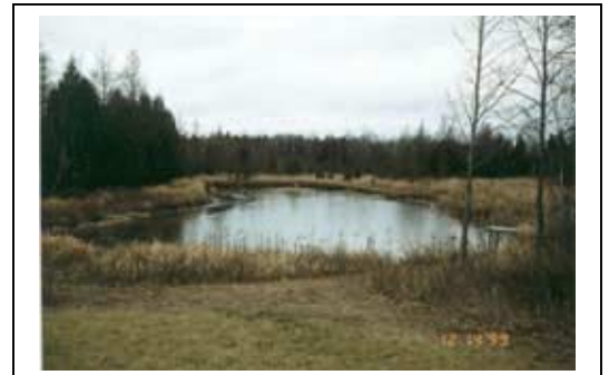
Bailey's Harbor Conservation Easement Door County Land Trust

New England Interstate Water Pollution Control Commission. 1993. A World in Our Backyard: A Wetlands Education and Stewardship Program . Video and Book. EPA New England, Boston, MA.