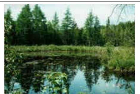
Cedar Ponds Conservation Easement Door County Land Trust