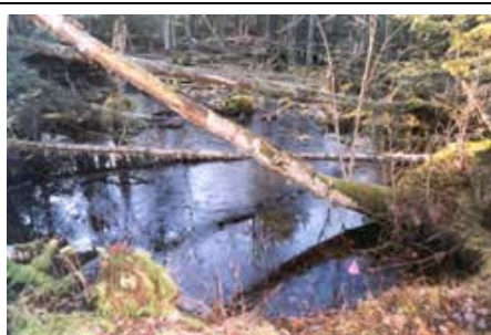
Shivering Sands wetland The Nature Conservancy

222 South Hamilton Street, Suite #1 Madison, WI 53703 608.250.9971 www.wiscwetlands.org