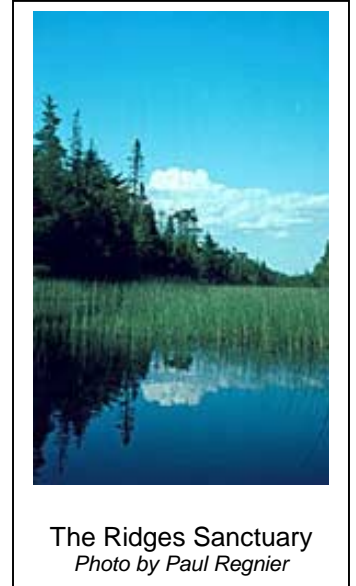
The Ridges Sanctuary