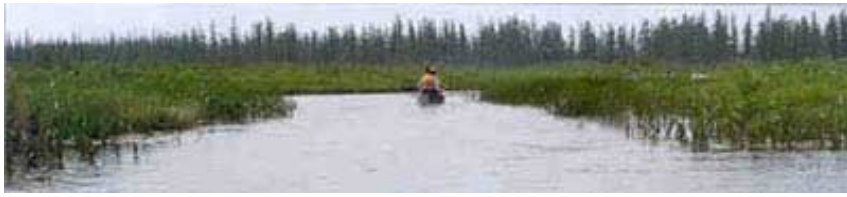
Kakagon Sloughs

Merryfield, Nicole. 2000. A Data Compilation and Assessment of Coastal Wetlands of Wisconsin's Great Lakes . Wisconsin Department of Natural Resources, Madison, WI. 145 pages.