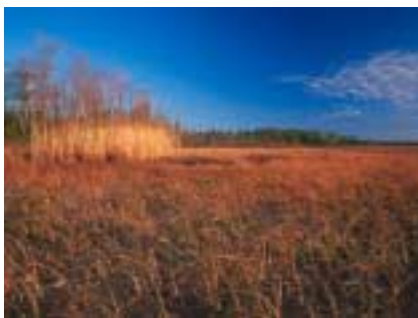
North Bay wetland The Nature Conservancy