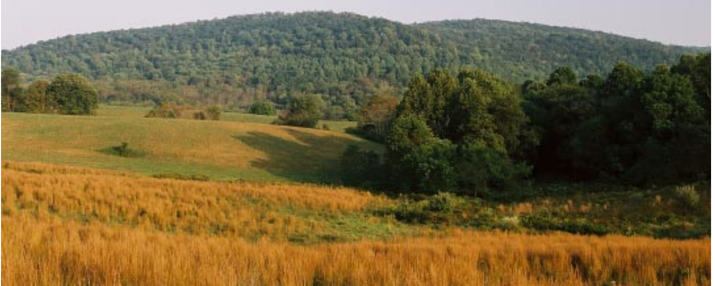
Clover Hill Farm