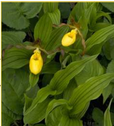
yellow lady's slipper Cypripedium parviflorum