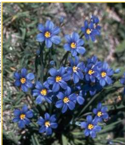
blue-eyed grass Sisyrinchium spp.