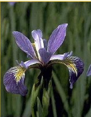
Jim Stasz @ USDA-NRCS PLANTS Database