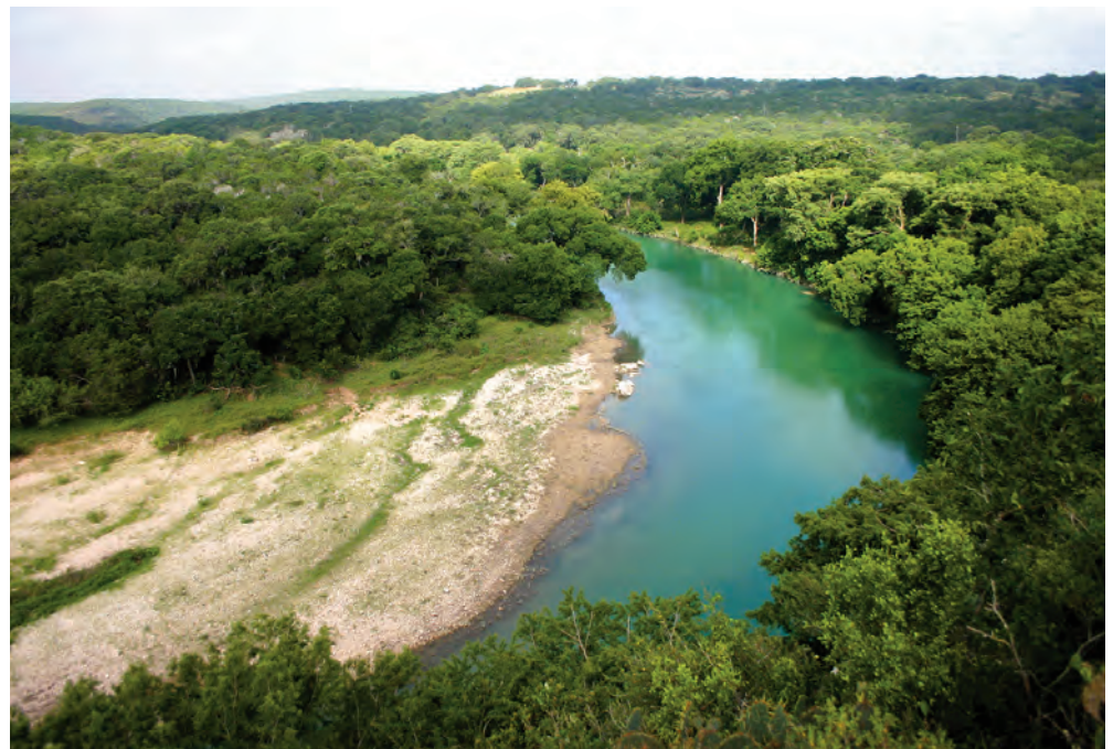
Blanco River

Partners: Texas State University-San Marcos, Wimberley Valley Watershed Association, Guadalupe Blanco River Trust, other non-governmental organizations, private landowners, local communities, and state and federal natural resource conservation agencies.