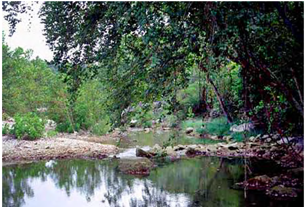
Barton Creek

Partners: City of Austin, Travis County, U.S. Fish and Wildlife Service, Texas Parks and Wildlife Department, neighbors and private landowners.