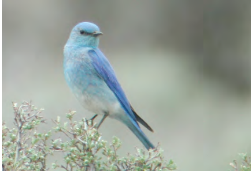
Mountain Bluebird near Fort Rock