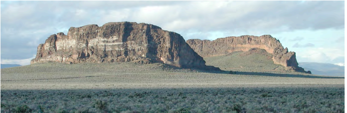
Fort Rock State Park

We begin our trip at noon in Bend at a location where there is street parking for those driving over from the Willamette Valley. We'll travel southeast on Highway 31 to do some birding in ponderosa pine forests. Often we see Western Bluebird, Lewis' Woodpecker, Mountain Chickadee, and other interesting birds in some recently burned areas. In the afternoon we visit Fort Rock State Park.