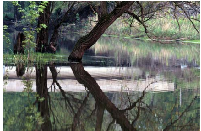
Lower Cedar Valley

The Conservancy is committed to working with businesses, communities and individuals to meet conservation challenges, using non-confrontational, market-based strategies. We pay property taxes where we own large tracts of land. For example, in 2004 the Conservancy paid $17,000 in property taxes on our Broken Kettle Grasslands preserve in Plymouth County. In the United States, working with only willing sellers and donors, the Conservancy protects habitat through gifts, exchanges, purchases, conservation easements and management agreements. Internationally, the Conservancy works with government agencies and partner organizations to provide scientific expertise, infrastructure, community development, professional training and long-term funding for legally protected but currently underfunded areas.