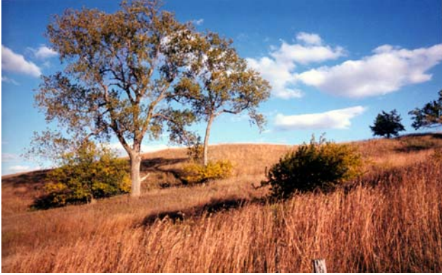
Waterman Creek Prairie

private landowners on grazing and controlled burning to conserve and restore prairies and savannas in priority areas.