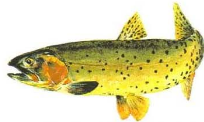
YELLOWSTONE CUTTHROAT Oncorhynchus bouvieri