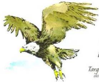
BALD EAGLE Haliaeetus leucocephalus