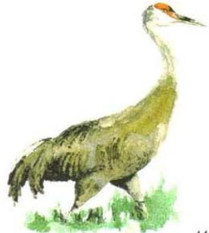
SANDHILL CRANE Grus canadensis