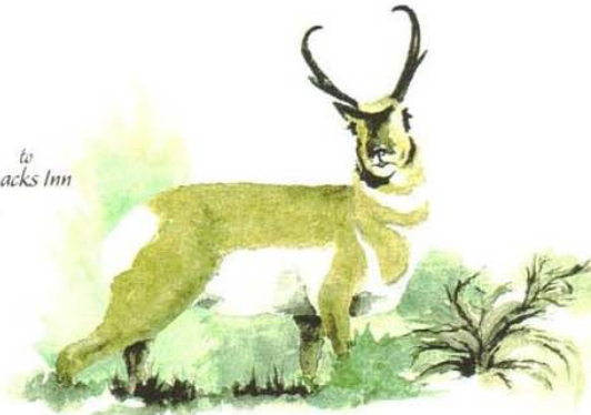
PRONGHORN Antilocapra americana