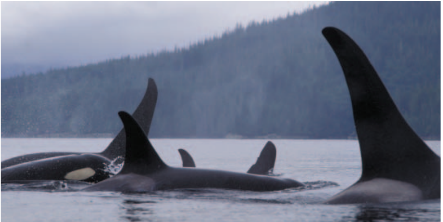
For thousands of years the First Nations livelihoods and cultures have been tied to the health of the seas.