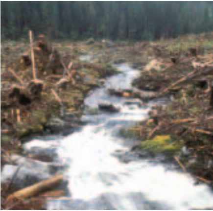
The clear-cutting of timber has impacts on every aspect of life in the Great Bear Rainforest.