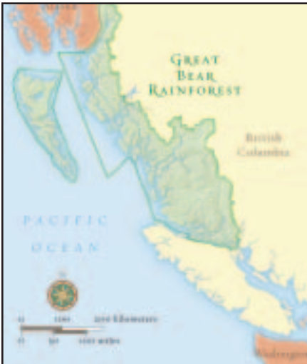
The Great Bear Rainforest and the archipelago of Haida Gwaii are entirely encompassed by the traditional territories of coastal First Nations.