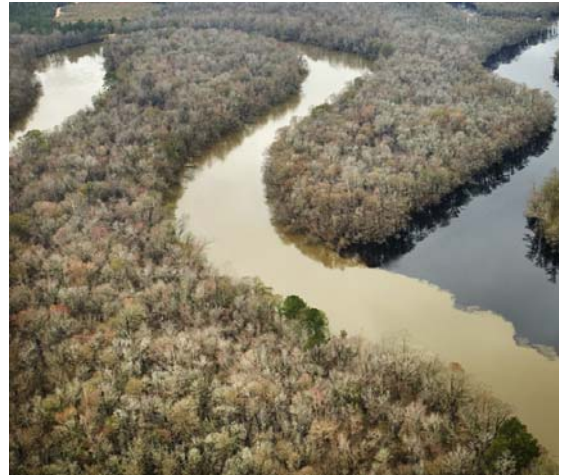
Flowing towards the southeast, the unique confluence of the brown water Pee Dee River as it merges with the tea-colored water of the Little Pee Dee River at the eastern tip of International Paper's Woodbury Tract.

The Nature Conservancy, International Paper and The Conservation Fund have undertaken a once-in-a-lifetime opportunity to protect ecologically important forests, rivers and streams in 10 southern states. The Nature Conservancy and The Conservation Fund will acquire more than 218,000 acres in the largest private land conservation project in the history of the southern U.S. Partners include state governments, federal agencies, the Department of Defense and timber investment entities.