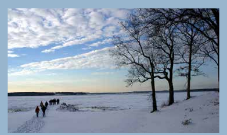
Winter hike at Lubberland Creek Preserve.

The idea for a "trail to the bay" became possible following 10 years of successful land protection in the Great Bay watershed. By 2007, the efforts of the GBRPP had conserved over 2,200 acres in the area on and around the Lubberland Creek Preserve. Beginning on Longmarsh Road in Durham, the Sweet Trail is a linear trail that passes through 4.2 miles of conserved land (half on the Lubberland Creek Preserve) and showcases the success of the partnership and the beauty and ecological importance of the wild and natural places that remain within the Great Bay watershed. The trail corridor was very carefully chosen to protect sensitive areas and minimize new disturbances. With much to offer in all seasons, the trail--named for Cyrus and Barbara Sweet, long-time supporters of land and marine conservation work in the Great Bay Estuary-is popularly used by families, school-groups, and outdoor enthusiasts from the community and region. Check out the Sweet Trail Map & Guide at bit.ly/SweetTrail for more.