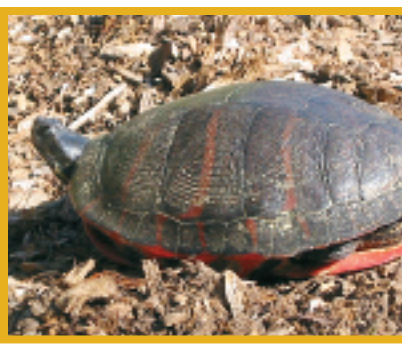
Venessa Salvucci, TNC

Formerly known as the Plymouth redbelly turtle and considered a separate species from populations found from New Jersey southward, the northern red-bellied cooters found in Plymouth County are now considered to be a sub-population long isolated from their southern